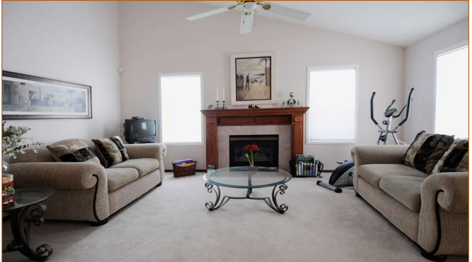
This vaulted great room is a comfortable space for curling up with a good book complete with a cozy gas fireplace. Open to the kitchen, it promises to be the social center of the home.