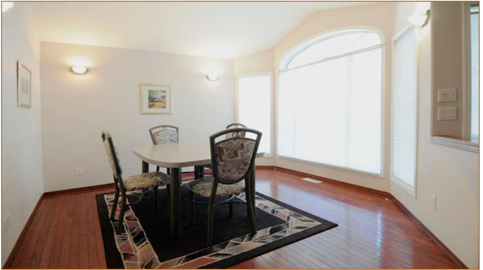
With gleaming hardwood floors, a vaulted ceiling and large bayed window overlooking the front porch this large dining room is a great space for hosting family & friends.