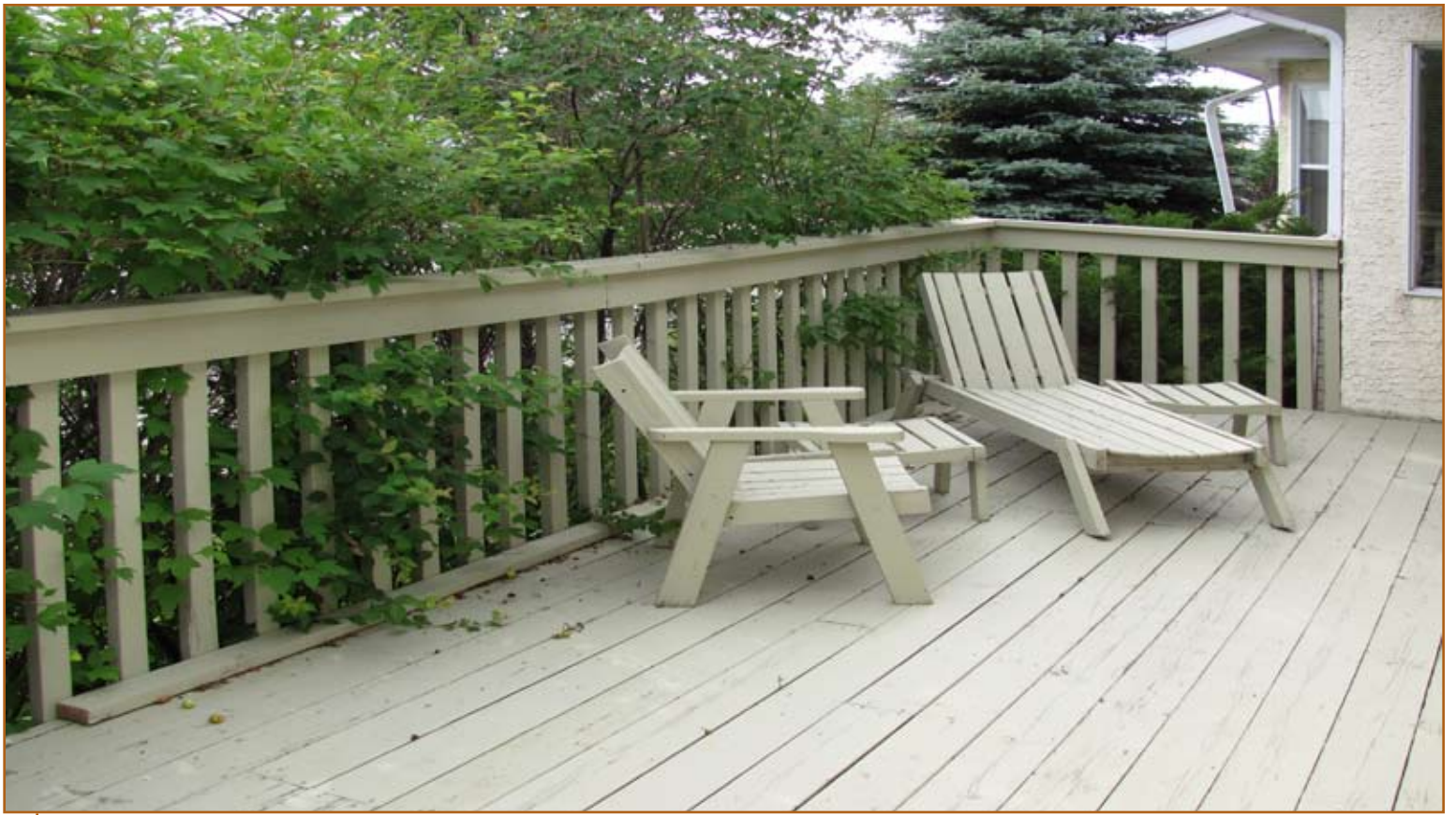
Mature trees and shrubbery provide shade and privacy on this large side deck: perfect for soaking up some sunshine, or dining al fresco!