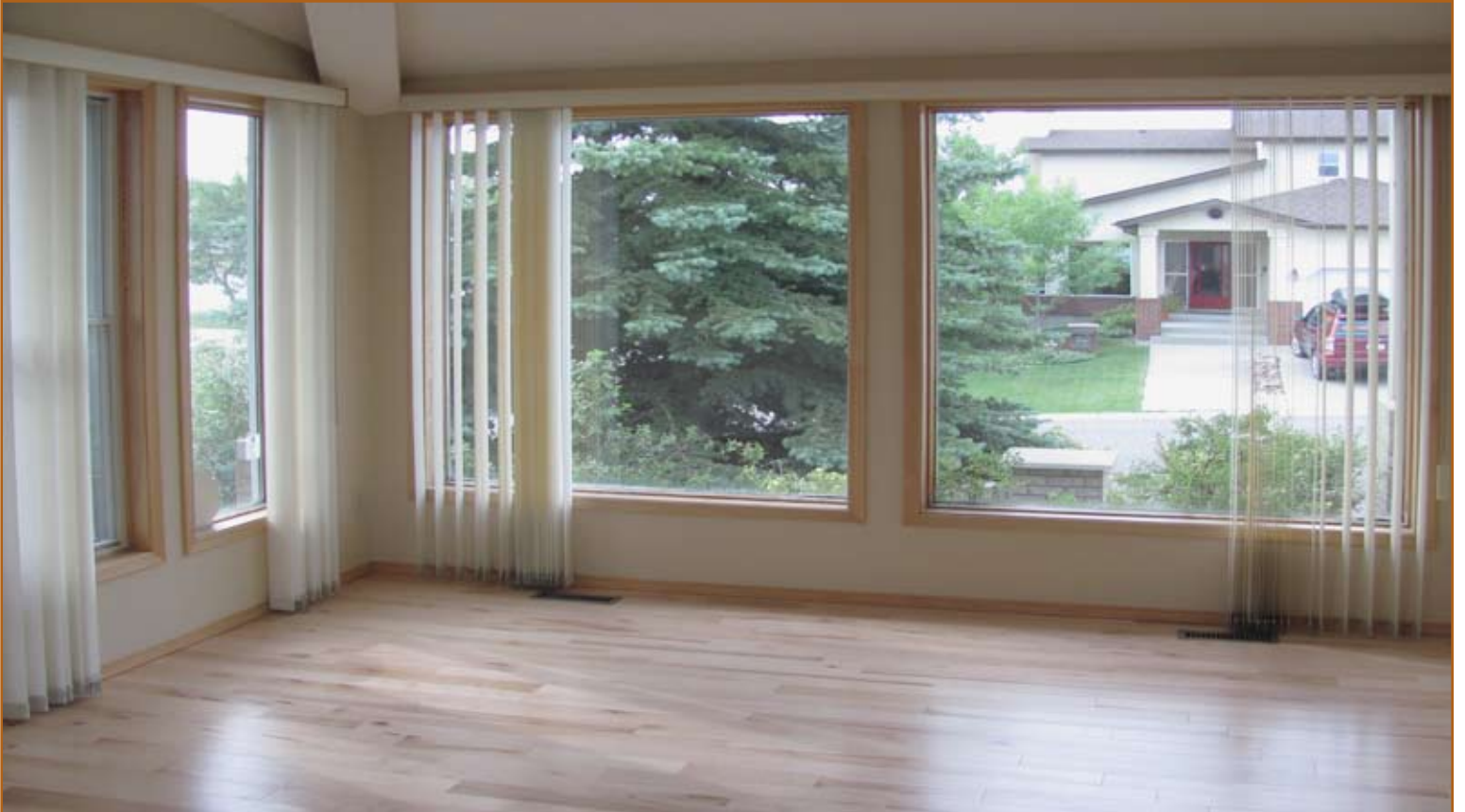
Featuring newer hardwood floors, this sunken living room is a bright space for guests to take a comfortable seat. A vaulted ceiling creates added space to this generously scaled room.