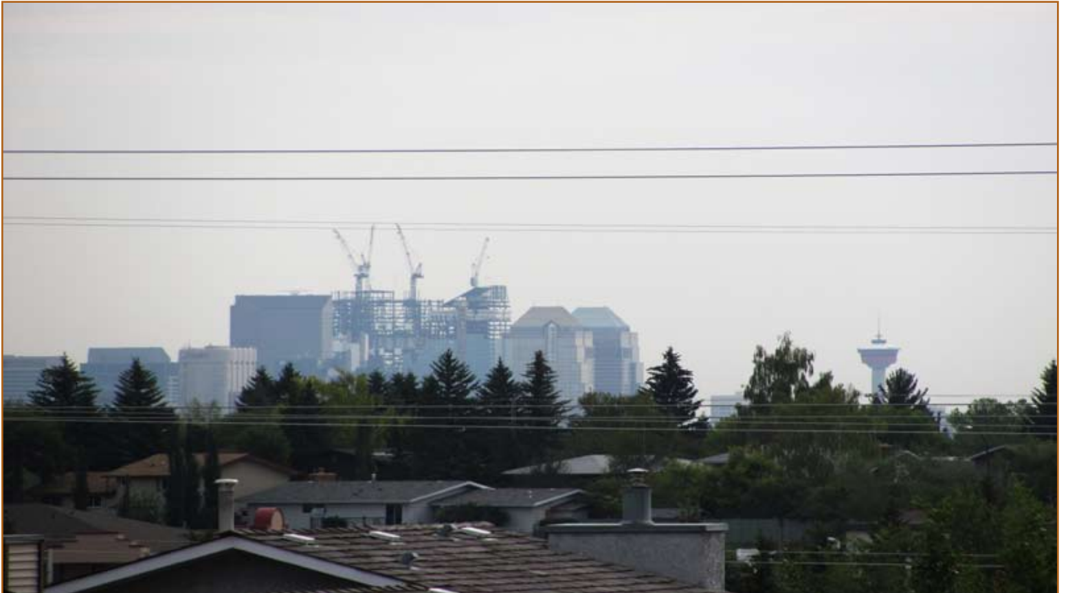
Enjoy the twinkling lights and ever-changing sky line of the downtown core from this charming home!