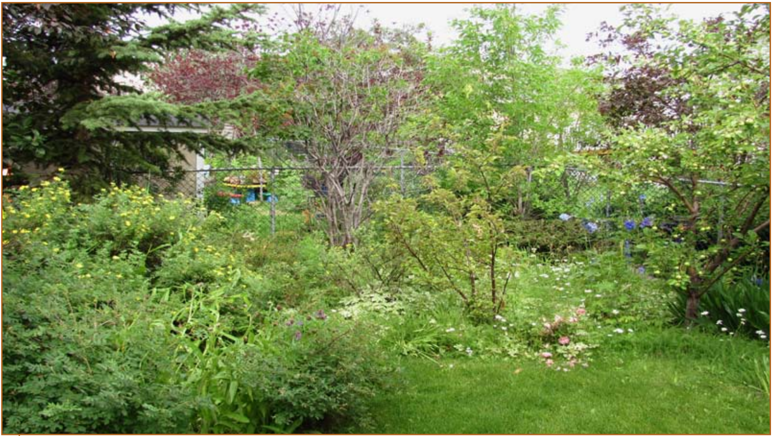
Mature trees create a beautiful home garden, including choke cherries, apples and crab apples!