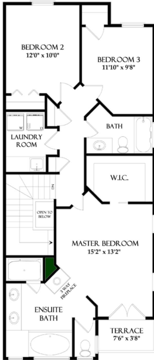
UPPER LEVEL - 937.97 Sq.Ft.