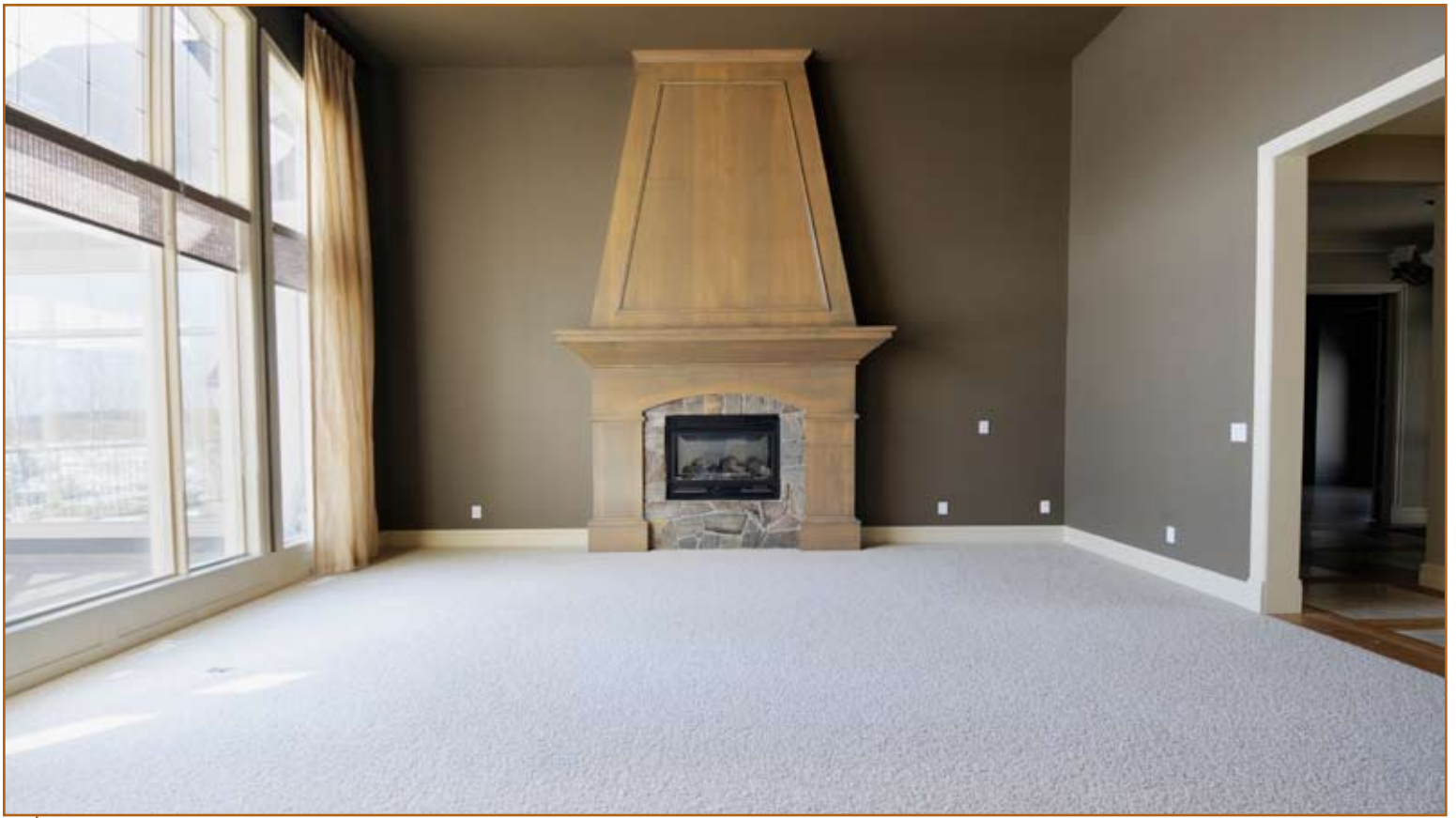
Overlooking the lake, this great room lives up to its name with a stunning gas fireplace with floor-to-ceiling mantle, an impressive wall of windows framing lake views and built-in storage.