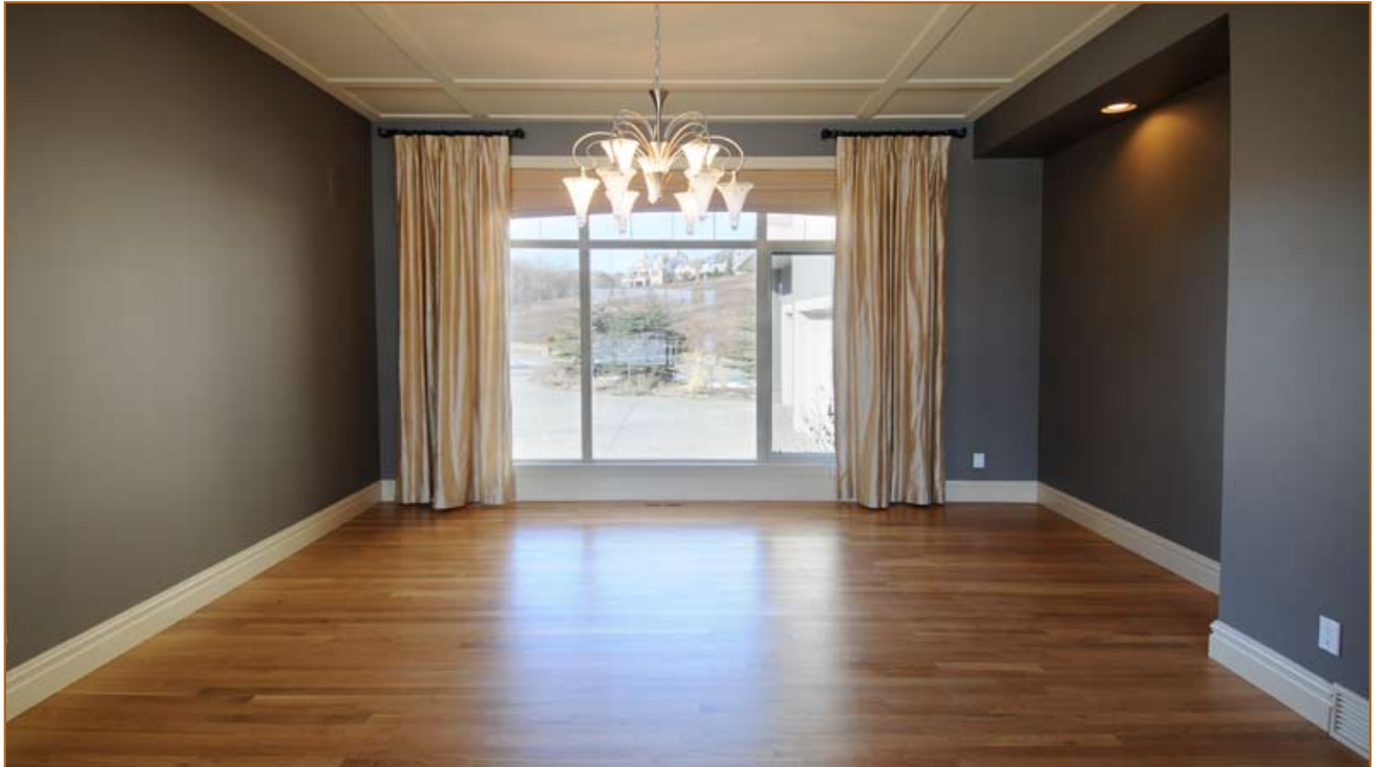
This elegant formal dining room is the perfect space for entertaining family and friends featuring rich hardwood floors, handsome ceiling details, eye-catching light fixture and a convenient hutch niche.