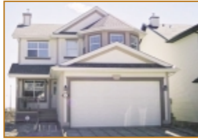
14 Cougarstone Mews SW $312,900 Half a Block to School

gas fireplace and bay window. Stylish European kitchen with bayed eating nook and access to backyard. The 3 bedrooms upstairs include owner's suite with walk-in closet and 2 piece ensuite bathroom. The insulated double detached garage has 220 volt wiring.