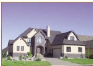
4 Majestic Gate SW $599,000 Home Spa and Pool

2879 sq. ft. 2 storey with fully-developed basement offering an extra 1462 sq. ft. of living space. Set on an 80' x 131' lot in desirable Elbow Valley Estates with 2 storey height ceilings in great room, rich oak kitchen and formal