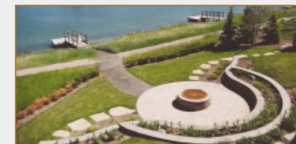
Elbow Valley $3,900,000 With Views, on the Lake

A cutting-edge and contemporary new home this 3492 sq. ft. 2 storey is set on a whisper quiet, exclusive cul-de-sac backing onto the river and nature reserve in Discovery Ridge. Designed to maximize views and featuring impressive limestone and hardwood flooring, waterfall feature wall, extensive built-ins, 3 fireplaces and stylish hand-blown light collection. The sleek, urban styled kitchen is stunning with stainless steel accents. Upper 3 bedrooms all with ensuite bathrooms incorporate state of the art fixtures. Fully-developed walkout with guest suite and 2 more bedrooms. See this home featured soon on the Discovery Channel.