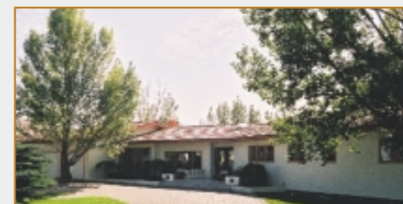
13036 Canso Place SW $1,900,000 3.67 Acres on Fish Creek Park

Superb location, backing onto the lake at Heritage Pointe with your own private dock. Spectacular show-home, a 3372 sq. ft. hillside bungalow with loft and fully-developed walkout basement, delivering over 5000 sq. ft. of ultra luxurious living space. Elegant French Country styling with rich woodwork, high ceilings, widespread hardwood floors, and grand principal rooms. Exceptional kitchen with gothic style maple cabinetry, extensive curved island and fireplace. Includes 3 bedrooms plus large loft above garage - suitable as artist's studio or charming playroom.