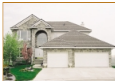
66 Patterson Close $619,900 Spectacular Views

and sleek maple and walnut kitchen with stainless steel back splash and appliances. The main floor owner's suite is exquisite featuring fireplace, French door to spacious wrap-around veranda, oversized walk-in closet and spa-like ensuite with European shower, ultra bath jetted tub and heated floors. The walkout basement hosts professional-style, two-tiered home theatre, games room with wet bar and waterfall feature wall, indoor swimming pool, steam shower/change room and exercise room.