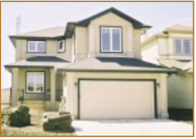
80 Wentworth Close SW $289,900 Family Friendly Plan

under-drive garage (tandem). An end unit with turret design creating bright sitting rooms in both living room and owner's bedroom. Fireplace feature wall with arched window. Includes formal dining room and sunny, chic white kitchen with glass-fronted cabinets. Upper den and 2 bedrooms include the large owner's suite with turreted sitting area and ensuite bathroom with jetted tub.