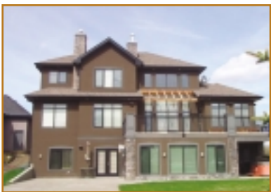
223 Snowberry Circle SW $995,000 Sleek & Contemporary

Impressive high ceilings, high transom windows, upgraded flat and stepped ceilings, superior lighting package, cornice mouldings, French doors, extensive built-ins and elegant paneling. The spacious gourmet kitchen, with beautiful maple floors, features smart white cabinets, granite counters and walk-through butler's pantry. Home includes main floor den, 4 upper bedrooms plus 5th bedroom, den and family room/games room in walkout basement.