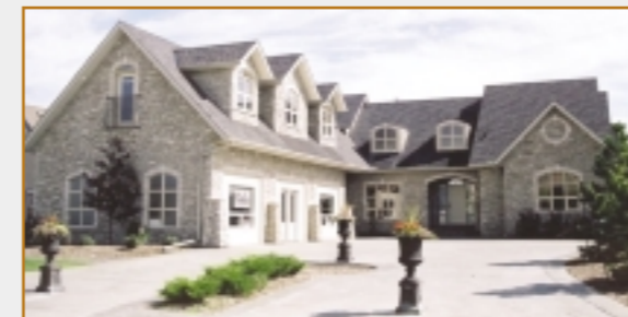
20 Heritage Lake Boulevard SW $1,250,000 On the Lake: Heritage Point

Walkout bungalow with grand, lower foyer and split staircase to main floor. Over 5,000 sq. ft. Formal living and dining rooms, main floor den and atrium. Gourmet kitchen with extensive cherry oak flooring, doors and built-ins. Ivory millwork, granite counters and river-rock fireplaces. Centre-vaulted family room has separate staircase to huge loft overlooking family room and grand hall. Large owner's suite with luxurious jetted-tub ensuite and steam shower. Two additional bedrooms up. Superb walkout development includes rec room, wet bar, spacious billiard room and access to heated 4-car garage with workshop.