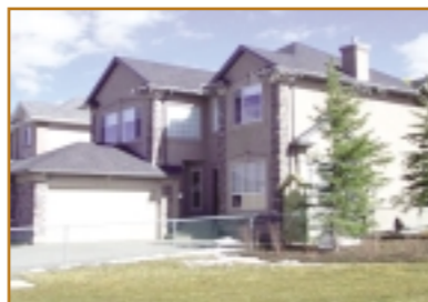
1560 Strathcona Drive SW $469,900 On the Park

Extensive maple hardwood, slate tile and Berber flooring - with upgraded underlay. Exceptional maple kitchen with granite countertop, under-mount sink and slate tile backsplash, Great room has maple built-ins and gas fireplace. Upper level boasts bonus room and 3 bedrooms.