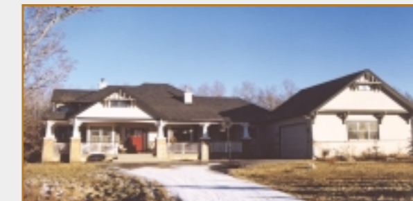
12 Wolfwillow Point SW $1,190,000 Private 2.2 Acres

Definitely one of a kind in Calgary. This spectacular 3.76 acre parcel in Canyon Meadows Estates is nestled into, and cascades down to, Fish Creek Provincial Park. The estate home is a 4000 sq. ft. contemporary styled, architecturally designed bungalow with a fully-developed basement offering a total of 6 bedrooms including an impressive owner's suite with sitting room to take advantage of magnificent views. When built this home was featured in "Western Living", "Canadian Interiors" and "House Beautiful - Kitchens & Baths" magazines.