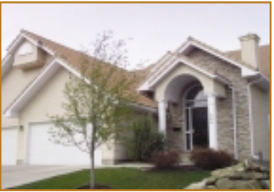
368 Signature Court SW $349,900 Walkout Villa

and iron and maple switchback stairway. Extensive tile and hardwood floors. Formal dining room or den with beveled glass entry. Great room with fireplace and built-in speakers. Maple kitchen has crown moulding, huge centre island and upgraded appliances. Upper level bonus room and 3 bedrooms including owner's with 5 piece ensuite bath.