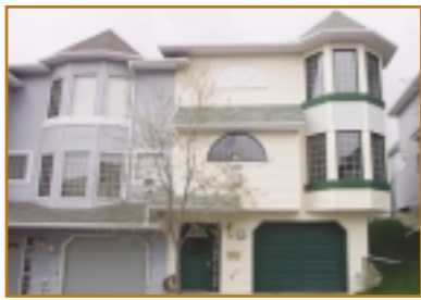
29 Patina Point SW $194,500 San Francisco Style

Just listed. Much desired, quiet location backing west onto greenbelt. Close to downtown, transit, shopping and Westside Recreation Centre. Stylish San Francisco-style 2 storey townhouse with over 1400 sq. ft. of living space and double