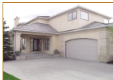
3030 Signal Hill Drive SW $695,000 Panoramic Views

fireplace/window feature wall. Impressive curved stairway and formal dining room with double French doors. Custom kitchen with extensive oak cabinetry and centre island. Owner's bedroom retreat enjoys private balcony, two-person jetted tub and fabulous 17 foot long, walk-in closet. Walkout basement is developed with in-floor heating. Air conditioned, triple garage, gorgeous pie lot!