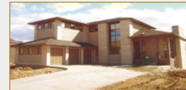
47 Discovery Valley Cove SW $1,350,000 Backing South on the River

This extraordinary new home in Elbow Valley Estates was designed and built to look as if it's been here for a hundred years. A heritage style bungalow set beautifully in the trees, overlooking ravine and creek. The reproduction, country-style kitchen with modern appliances includes an old Chicago brick forno oven. Extensive hardwood floors, arts and crafts' style architectural details, two wood-burning river rock fireplaces, sun room, huge mud room, butler's pantry and sewing room. The fully-developed basement features 4 bedrooms, exercise room and media room.