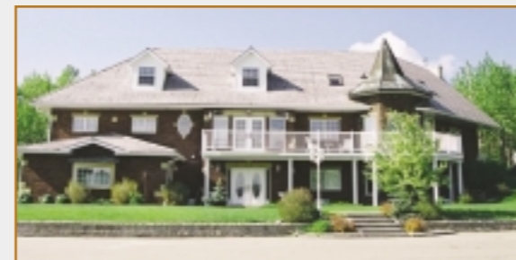
103 Nagway Court $995,000 Elegant Country Lifestyle Appeal

View interior photos at www.samsluxuryhomes.com