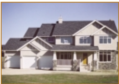
25036 Briarwood Drive $725,000 Developed Walkout

coverings and full landscaping. The superb working kitchen is the heart of this home with an abundance of richly stained maple cabinetry, built-ins and granite countertops. Also, large dual height centre island, built-in china cabinet, long buffet and walk-in pantry. This beautiful home features main floor den and 3 upper bedrooms including the luxurious owner's suite with adjacent sitting room.