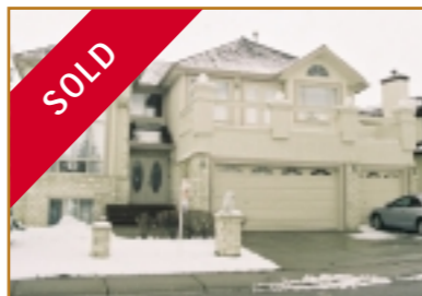
75 Patterson Drive SW $499,900 5 Bedrooms Up

upgraded lighting package throughout. Maple kitchen with preferred granite counters. Includes main floor den with French doors, formal dining room, upper bonus room and 3 bedrooms. Fully-developed basement with every man's dream: media room with large wet bar/kitchen.