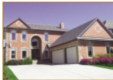
50 Patterson Close SW $795,000 Spectacular Views

high and atrium-style windows, takes advantage of the magnificent views. Extensive hardwood flooring, coffered ceilings, cornice moulding and pillars. Current owners recently spent $200,000 in upgrades including gourmet kitchen with granite counters and professional-style, stainless steel appliances. The upper floor provides 3 bedrooms including the owner's suite accessed via an open bridge overlooking the living and dining rooms.