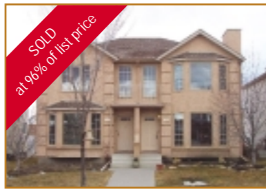
7168 Sierra Morena Blvd. SW $209,900 Double Garage

large windows and curved stairway with iron railings. Includes formal dining room, main floor den with double French doors and impressive great room with 10 foot ceilings, slate fireplace and maple built-ins. The gourmet kitchen with maple cabinetry and black granite countertops includes stainless steel appliances. Upstairs the 3 bedrooms include an extensive owner's suite with walk-in and 5 piece ensuite. The walkout basement is developed with games room, family room, full bathroom and ready for a fourth bedroom.