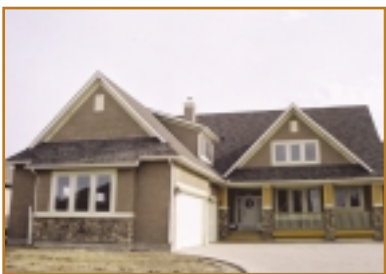
36 Golden Aspen Crest SW $649,900 Fabulous Kitchen

dining room with arched entryway. Main floor owner's suite and 2 upper bedrooms plus bonus room with separate entry - ideal as a home office. The fully-developed basement with in-floor heating, includes indoor pool and hot tub, games room and bathroom/change room. Oversized double garage has in-floor heating.