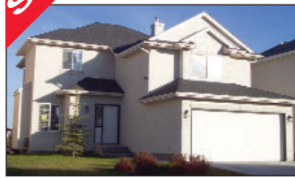
30 Strathridge Way S.W.