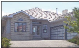
2980 Signal Hill Drive S.W.