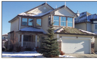
18566 Chaparral Manor S.E.