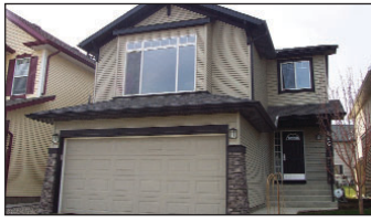
146 Cougarstone Circle S.W.