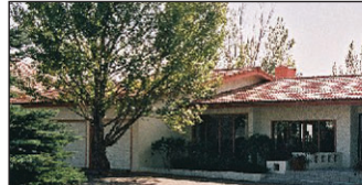
13036 Canso Place S.W.