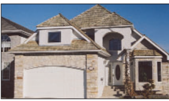
5638 Coach Hill Road S.W.