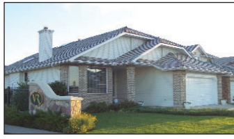
3 Valley Ridge Green N.W.