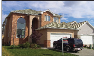
26 Royal Crest Way N.W.