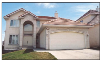
378 Patterson Blvd. S.W.