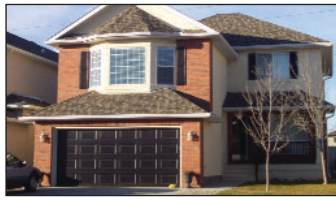
1493 Strathcona Drive S.W.