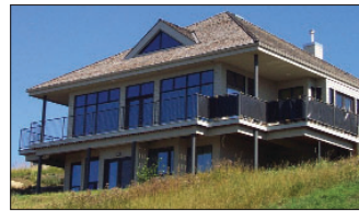
235 Slopeview Drive S.W.