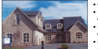
20 Heritage Lake Blvd.