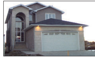
43 West Cedar Rise S.W.