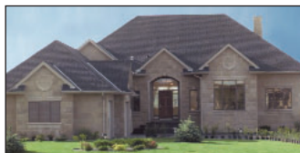
123 Lynx Meadows Drive N.W.