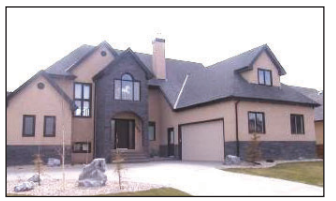
4 Majestic Gate