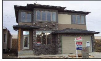
142 Discovery Ridge Way S.W.