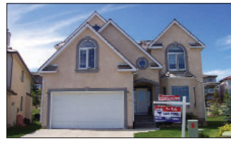
115 Signature Terrace S.W.