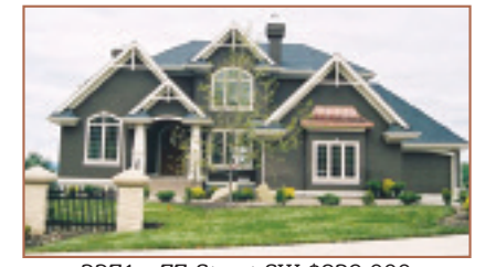
3371 - 77 Street SW $829,000 SPRING VALLEY ESTATES, NEW

Beautifully designed, gently used, one owner home in desirable "Hamptons" backing onto the golf course and ravine with panoramic city & countryside views from all 3 levels! 3511 sq. ft. 2 storey + fully developed walkout basement & triple attached garage, finishing details include ivory millwork, plush carpeting, antiqued cabinetry, granite countertops, maple built-ins, open string curved stairway, main floor den, huge gourmet kitchen, a total of 5 bedrooms (3 w/ full ensuite bathrooms) and master suite with 2 walk-in closets, huge bow window to enjoy views.