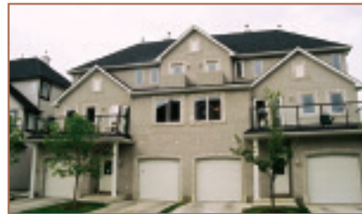
49 Simcoe Place SW $214,900 UPSCALE TOWNHOUSE

The ideal location, this neat townhome is an end unit, set in a quiet cul-de-sac both backing & siding onto the ravine! Features rich oak hardwood flooring and cherry toned kitchen cabinetry and built-ins, marble faced gas fireplace, neutral toned carpeting, white raised panel doors, double turret design (turrets on both back & front of unit) with lots of windows so that natural light floods in on three sides (living room, large island kitchen, upper den & master bedroom all feature the turret with wrap around windows), 2 Bedrooms, jet tub ensuite w/ separate shower. Double underdrive (tandem) garage.