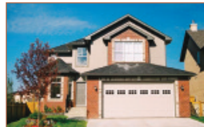
11 Strathlea Cres. SW $449,000 SPRING HAVEN BEST BUY

Have a friend help pay your mortgage: this 3 storey brownstone in Garrison Woods has a walkout basement with private entrance and a 600 sq. ft. space w/ kitchenette, Living Rm & bedroom w/ ensuite bathroom. The upper floors offer over 2000 sq. ft. w/ 9' high ceilings, open plan w/ gas fireplace, white kitchen, hardwood flooring, bay windows, large deck off the eating nook, 2nd floor w/ 2 BR & loft + fully finished 3rd floor w/ high ceiling, ideal as a games room, media room or home office. Walk to shopping & restaurants in trendy Marda Loop