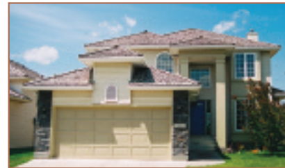
144 Sierra Madre Cres. SW $329,000 RICHMOND HILL ON GREENBELT

Simcoe Heights, walk to West Side Rec Centre, Sunterra Market & stylish boutiques! This sun-filled & upscale townhouse offers over 1500 s.f. of living space w/ a single garage. Built in 2001 and featuring extensive slate flooring, upgraded berber carpeting, gas fireplace, large windows, huge deck-style balcony, master bedroom w/ Juliet balcony, large walk-in closet & full ensuite + 2 big additional bedrooms w/ corner windows. Undeveloped basement ideal for future 4th BR or home office. Fantastic, like a showhome!