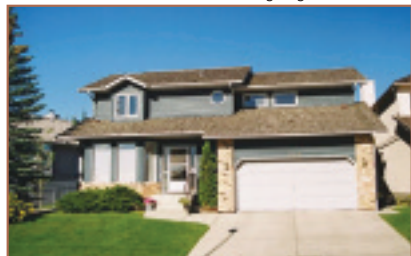
195 Strathaven Circle SW $349,000 STRATHCONA STEPS TO SCHOOL

Unobstructed view property! Terrific location. This 3530 sq.ft. 2 storey offers panoramic mountain & city views from both main & upper floors, has a developed walkout basement & a 4 car attached garage! Grand open design with high ceilings, large great room w/ 11' high ceilings, sweeping iron & maple staircase, extensive hardwood floors, huge windows, gourmet kitchen w/ antiqued maple cabinetry, granite counters & centre island, formal dining room, sitting room, den with stone fireplace, 3 upper bedrooms & bonus room.