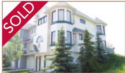
88 Prominence View SW $209,900 BACKING & SIDING RAVINE

The ideal location, this neat townhome is an end unit, set in a quiet cul-de-sac both backing & siding onto the ravine! Features rich oak hardwood flooring and cherry toned kitchen cabinetry and built-ins, marble faced gas fireplace, neutral toned carpeting, white raised panel doors, double turret design (turrets on both back & front of unit) with lots of windows so that natural light floods in on three sides (living room, large island kitchen, upper den & master bedroom all feature the turret with wrap around windows), 2 Bedrooms, jet tub ensuite w/ separate shower. Double underdrive (tandem) garage.