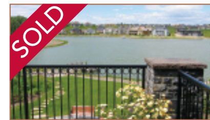
Elbow Valley $1,190,000 LAKEFRONT BUNGALOW

Spectacular home, high on the hill, with panoramic, unobstructed Rocky Mountain views from both levels! This hillside bungalow offers a total of almost 6700 sq. ft. of living space and was completed in 1998. finishing details include a mix of 9' to 20' high ceilings, grand open "split" staircase w/ iron spindles, hardwood floors, white millwork, natural wood cabinetry, granite counters, river-rock fireplaces, built-ins, a total of 4 bedrooms (all w/ ensuite), master w/ 2nd floor observatory/artist's retreat, huge media room and triple attached garage.