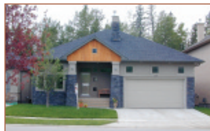
118 discovery Ridge Blvd. SW $549,000 TRENDY BUNGALOW ON GREENBELT

New home ready for immediate possession! bright & well planned 2 storey, 2406 sq.ft. on cul-de-sac, walking distance to Westside Rec Centre! Finished w/ 9' high bordered ceilings, white millwork, maple cabinetry, granite countertops, rich brazilian cherry hardwood, foyer w/ high ceilings, open staircase, Great Rm w/ elegant arch-topped built-ins, large kitchen with stainless Steel appliances. 3 upper BR & bonus Rm.