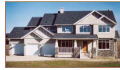
25036 Briarwood Drive $695,000 BEARSPAW, 2 ACRE PARCEL

The Estates of Richmond Hill, terrific location, on a quiet crescent backing west onto a greenbelt with walking pathway. This 2092 sq. ft. 2 storey also has a finished basement offering an additional 585 s.f. of living space for a total of almost 2700 s.f.! It's a great room plan w/ formal dining room, large kitchen w/ centre island/eating bar, dining nook opening to deck, den with French door, upper loft overlooking foyer, huge master w/ jet tub ensuite, 2 additional BR + basement w/ games room & adjoining den/bedroom & full bathroom.