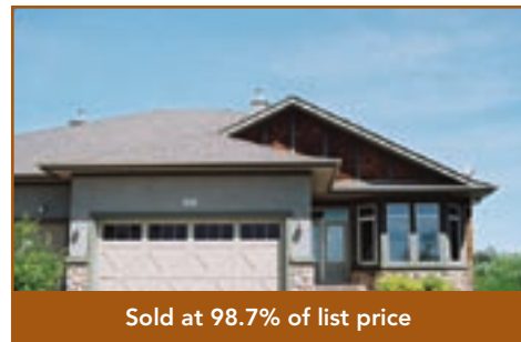
Sold at 98.7% of list price

Elbow Valley $379,000 47 Bent Tree Court