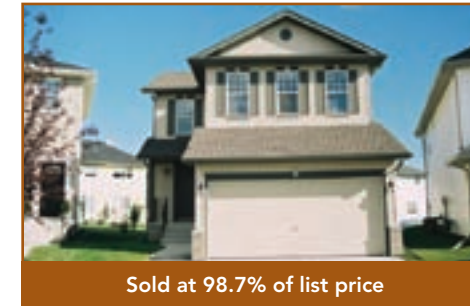
Sold at 98.7% of list price

Instantly appealing, fabulous upgraded 2 stry twtns with finished walkout, backing greenbelt, 1600 s.f. with hardwood thru main, Chef's kitchen with granite counters, Sub Zero fridge & upgraded stainless steel appliances, Built-in sound & entry system, 2 master bedrooms both with full walk-in closet & ensuite, walkout to the patio + full width deck with vinyl deck and glass surround. Condo fee $177/mo.