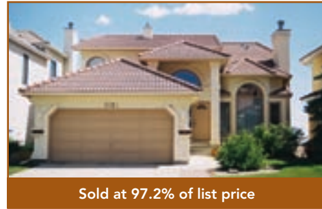
Sold at 97.2% of list price

Beautiful attached bungalow (villa) on large lot in exclusive, private cul-de-sac. 1258 s.f. on the main floor plus fully finished basement (over 2100 s.f.), offering a total of 3 bedrooms & den, and featuring 10-ft high ceilings & hardwood throughout the main floor, maple kitchen with island, Liv Rm & Fam Rm both with fireplaces, master BR with 5-pc ensuite. All appliances included. Condo fee $139/month.