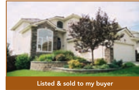
Listed & sold to my buyer

Beautiful bungalow villa, like new! 1553 s.f. + developed basement offering 9-ft ceilings w/ heavy cornice mouldings, white millwork, French doors, white kitchen w/ granite counters & beautifully detailed centre island, hardwood, slate & granite floors, 2 fireplaces, total of 3 BR + 2 dens. Simply beautiful, nothing to do but move in (immediate poss'n)!