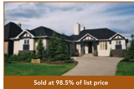
Sold at 98.5% of list price

Spectacular executive attached home, 2316 s.f. + fully developed walkout basement, quiet cul-de-sac location, backing south! Stylish, clean-lined and high end finishes top to bottom. Features high ceilings & windows, gourmet kitchen with granite counters, hardwood floors, 3 bedrooms up + 2 bedrooms down, main floor den, 4 baths, central air conditioning, shows like a new home!