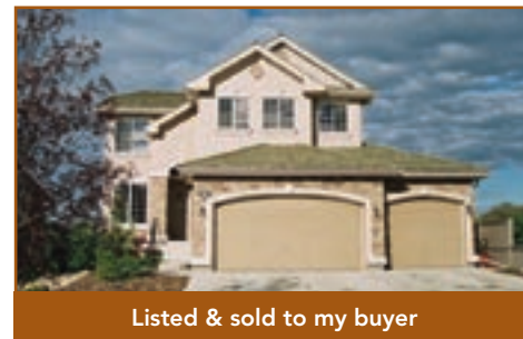
Listed & sold to my buyer

Premier cul-de-sac, backing onto the park. 1778 s.f. bungalow with dev'd walkout basement, total of 5 BR, vaulted main floor with views overlooking the park, kitchen with maple cabinetry & granite counters, master BR with steam shower & jet tub ensuite. A short walk to skating rink, sports field & Battalion Park elementary school.