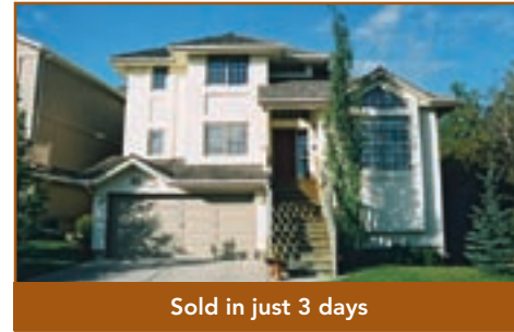
Sold in just 3 days

Solid & extremely well kept original owner home! 2233 s.f. with very large Living & Dining Rooms (ideal for entertaining), roomy oak kitchen, adjoining main floor family room with oak paneling, 3 upper bedrooms + 1 on main floor, basement developed with 2 more bedrooms, newer bathroom with steam shower, Games Rm, Sewing Rm, Cold Rm & summer kitchen. This is a large pie lot on a cul-de-sac.