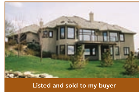
Listed and sold to my buyer

Best value in the area, 1975 s.f. bungalow with fully developed walkout bsmt, almost 4000 s.f. of living space! Vaulted Great Rm w/ large windows to enjoy tranquil views over the greenbelt, master BR with clawfoot tub ensuite, 4 BR in total, walkout w/ family room, media room, large wine room. Triple garage.