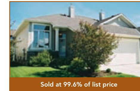
Sold at 99.6% of list price

Totally upgraded, very stylish newer townhome, 2010 s.f. which comes with all appliances (including washer/dryer & even the patio furniture) + central air conditioning!, bright & open plan w/ formal Dining Room, maple kitchen w/ walk-thru pantry, granite counters, Great Room & Bonus Room + 3 bedrooms upstairs, condo fee only $150/month.