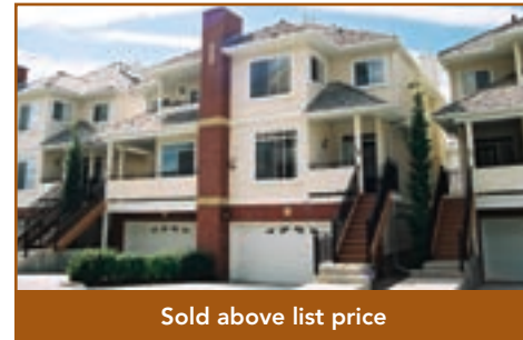
Sold above list price

Former showhome, 2 stry twtns w/ finished walkout basement in attractive complex. 1600 s.f. offering big & bright kitchen w/ white cabinetry & breakfast nook, formal dining room, living room with corner fireplace, 2 master bedrooms up both w/ walk-in closet & ensuite bathroom, games room in walkout, double att. garage. west exposure.