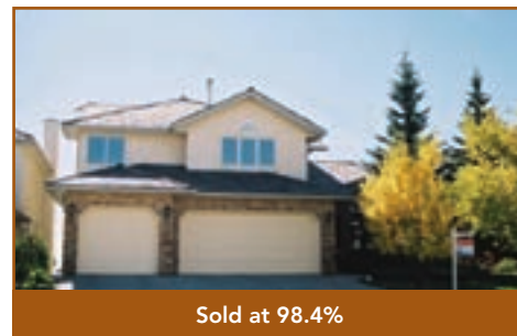
Sold at 98.4%

Panoramic views! This 1612 s.f. bungalow sits on the ridge with unobstructed views to the south and towards the mountains in "The Summit" of Signal Hill. Features vaulted ceilings thru main floor, hardwood & new upgraded carpeting, upgraded stainless steel appliances, elegant open staircase to developed walkout, 2 + 2 bedrooms.