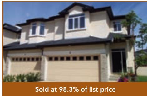
Sold at 98.3% of list price

West Springs $239,000 6 Wentworth Cove, SW