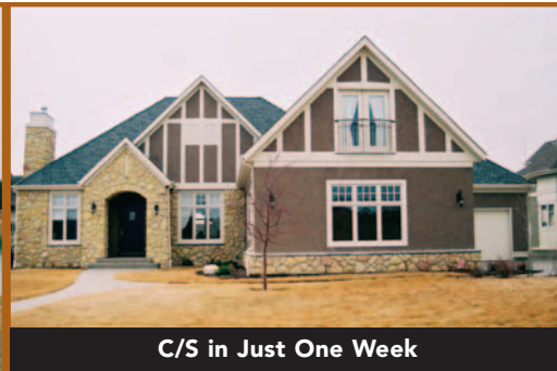
C/S in Just One Week