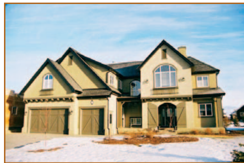
Elbow Valley $895,000 Pie Lot on Greenbelt

Open, bright, clean lined, sun-filled two-story, offering over 3000sq.ft. of sleek and tastefully designed living space. Backing west onto the greenbelt with views to the pond. Features hardwood & ceramic flooring, ivory millwork & gourmet kitchen with stainless steel appliances & granite counter tops, stairways with iron railing, many furniture quality built-ins and 4 spacious upper bedrooms.