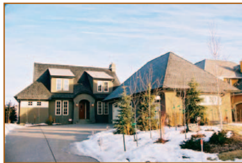
Elbow Valley $975,000 Almost 4700 SQ.FT.

Quite cul-de-sac backing onto greenbelt, immaculately kept 3631 sq.ft. 2 story with 9& 10' high ceilings, barrel vaulted ceilings, cornice mouldings, ivory millwork, antiqued maple kitchen cabinetry, granite countertops, maple flooring, huge laundry/sewing room, country kitchen with large butler's pantry, with space for freezer, 3 bedrooms & den plus bonus room. Thoughtfully designed, perfect for family & entertaining! Triple attached garage.