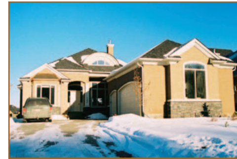
Elbow Valley $825,000 Over Looking the Water

Exquisite 2 story with fully developed walkout basement offering over 5500sq.ft. of luxurious living space. Amazing kitchen with distressed French county cabinetry, granite & stainless steel, furniture quality built-ins, limestone flooring in kitchen & baths, 500 linear feet of custom wainscoting, 4 + 2 bedrooms, ensuite with vaulted ceiling, upper level den, perfect location backing onto greenbelt. Triple garage. Full sandstone front, over $50,000 spent on front facade alone.