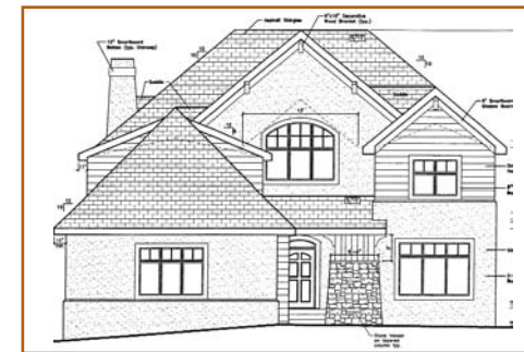
Elbow Valley $895,000 New Construction

Exquisite custom built bungalow offering 2137sq.ft. on the main floor plus fully developed walkout basement. Excellent location fronting onto a large pond. Featuring extensive limestone & maple flooring, ivory millwork, high & barrel vaulted ceilings, huge windows & numerous built-ins. Great room with wall of book cases, formal dining room with 18' ceiling, huge gourmet kitchen with black granite countertops, island and top of the line appliances. 1+3 bedrooms, sound proof media room & games room developed down.