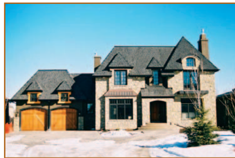
Elbow Valley $1,175,000 Rich Woodwork, Elegant Design

An exciting opportunity to move into a new home in Elbow Valley Estates. This 3606 sq.ft. 2 story sides onto the golf course, overlooks the water and fronts the woodlands. Features include a huge front courtyard entertaining space with outdoor fireplace, master bedroom suite with luxurious 5 piece ensuite bath and Juliet balcony overlooking the courtyard, great room and kitchen with huge island/eating bar opening out to large deck, 4 upper bedrooms.