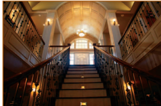
Elbow Valley $3.6 Million Backing Onto The Lake

Award winning former Laratta show home. Located on the lake in Elbow Valley Estates. This 2345sq.ft., 4 bedroom bungalow also has a developed walkout basement. Very bright and spacious open plan with polished lime stone and cherry flooring. Wrought iron railings and exquisite open ceilings with exposed beams. Generously scaled formal dining room with paneled ceilings. Large kitchen with cherry cabinetry, granite & top of the line stainless steel appliances.