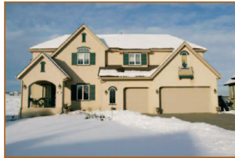
Elbow Valley $798,000 Rich Traditional Style

Beautifully appointed family home backing west in a cul-de-sac overlooking a pond. Offering almost 3800 sq.ft. including a fully developed walkout. Very high end finishing details: high coffered ceilings, ivory millwork, pearized doors, faux finish paint treatments, extensive hardwood flooring, numerous built-ins, 3 fireplaces, fabulous kitchen with all the bells and whistles, maple cabinetry, granite & cultured marble countertops, main floor master suite with jetted tub ensuite and dressing room. Total of 6 bedrooms.