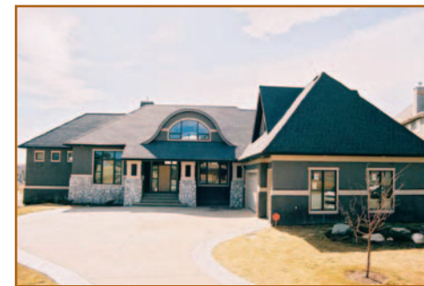
Elbow Valley $1,190,000 Walkout Bungalow, Pie Lot

New arts & crafts style 2 story, nearing completion & ready for occupancy approx. June 1st. Located on pie lot in quiet cul-de-sac in North Elbow Valley. 3795 sq. ft. plus fully developed walkout basement offering almost 5300 sq. ft. of development with 3+2 Bedrooms, bonus room and den. Finishing details include high ceilings, walnut-toned oak doors & paneling, cherry cabinetry & built-ins, granite counters, 2 double sided stone fireplaces + fireplace in master suite, 3 wet bars, extensive American cherry flooring on main & upper floors, developed walkout w/ rec room, media room & 2 bedrooms.