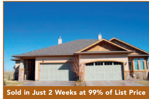
Sold in Just 2 Weeks at 99% of List Price

This highly-desired neighbourhood features natural ravines, mature trees, ponds and lakes in an open country setting with stunning views and easy access to amenities, downtown Calgary and the mountains.