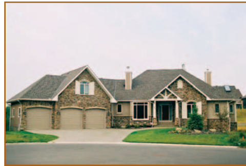
Elbow Valley $795,000 Views to Pond

with fireplace + 4 large bedrooms in the walk-out basement. Features 10 & 11 foot high ceilings, beamed ceiling in great room, superb media room down, magnificent kitchen with commercial style gas range, warming oven, dual sinks & ovens + built-in Miele coffee and espresso maker! Huge covered deck with it's own heater overlooks the lake!