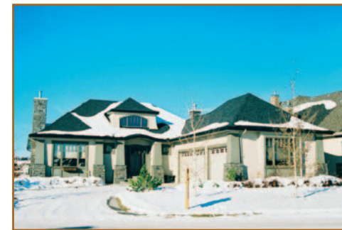
Elbow Valley $ 1,225,000 Backing on the Lake

Spacious executive home ideally located on quiet cul-de-sac in desirable Elbow Valley. 4000 sq. ft. on main & loft + fully developed walkout basement offering a total of over 6300 sq. ft. of luxurious living space w/ 3 bedrooms, den, loft & bonus room (or large 4th bedroom). Arts & Crafts style finishing including 2 dormers, mix of vaulted, 10' high & coffered ceilings, extensive cherry paneling, built-ins & cabinetry, granite counter & vanity tops, extensive maple & slate flooring, switchback staircases w/ iron spindles, built-in sound system, CAT-5 wiring and top of the line appliances in gourmet kitchen. Backyard features "putting green"!