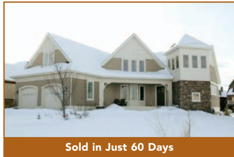
Sold in Just 60 Days

Beautifully designed & immaculately maintained attached villa condominium in quiet cul-de-sac, both facing & backing onto a greenbelt! Over 2600 sq. ft. of living space including fully developed daylight basement. Features 9' high ceilings, decorative columns, 2 river-rock gas fireplaces, white millwork, maple cabinetry, granite countertops, maple & plush carpet flooring, built-in sound system, top of the line stainless steel appliances, central air conditioning & top of the line HEPA Air filtration system. Open plan w/ total of 3 bedrooms, 3 baths. Like a show home!