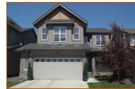
Discovery Ridge $639,000 314 Discovery Ridge Way SW

Steps to Griffiths Woods Park, this family home offers over 3000 s.f. of developed living space! 3 + 1 bedroom & den, rich hardwood floors, stone facing fireplaces, stainless steel appliances, main floor laundry, 5 piece master ensuite & large rec. room in developed basement!