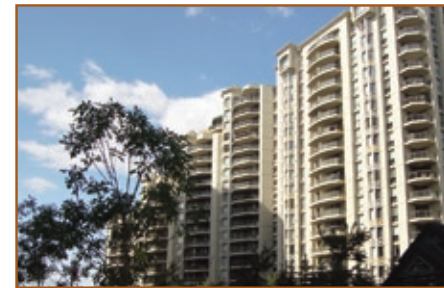
The Marquis - Downtown West $1,195,000 #1603, 1108 – 6th Avenue SW

Unbelievable 2342 s.f., 3 bedroom, 2 den executive condo in the Marquis. Located in the heart of downtown with incredible Bow river & cityscape views, 3 spacious balconies & 2 titled side by side parking stalls (option to purchase a 3rd). Everything is top of the line here!