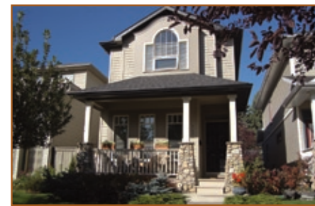
Killarney $595,000 2603 – 25A Street SW

This 1568 s.f. 2-storey home boasts rich hardwood floors, crown moulding, an island-style kitchen with slate tile flooring & granite counters. Barrel vault ceiling & stone-faced fireplace in great room. Vaulted master with rain shower & jet-tub ensuite. Private rear yard with mature trees.