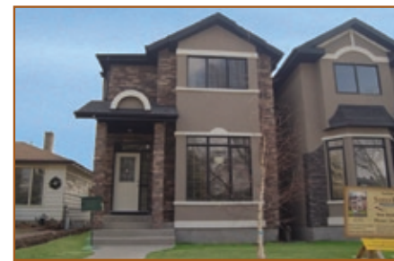
Altadore $850,000 4218 – 18th Street SW

Another gem by Saddle River Custom Homes! 1898 + 741 s.f. with a beautifully finished basement, "The Chelsea" features hardwood flooring, Legacy kitchen with stainless steel appliances & granite counters. 3-sided fireplace in master retreat & luxurious 6 piece master ensuite with jetted shower!