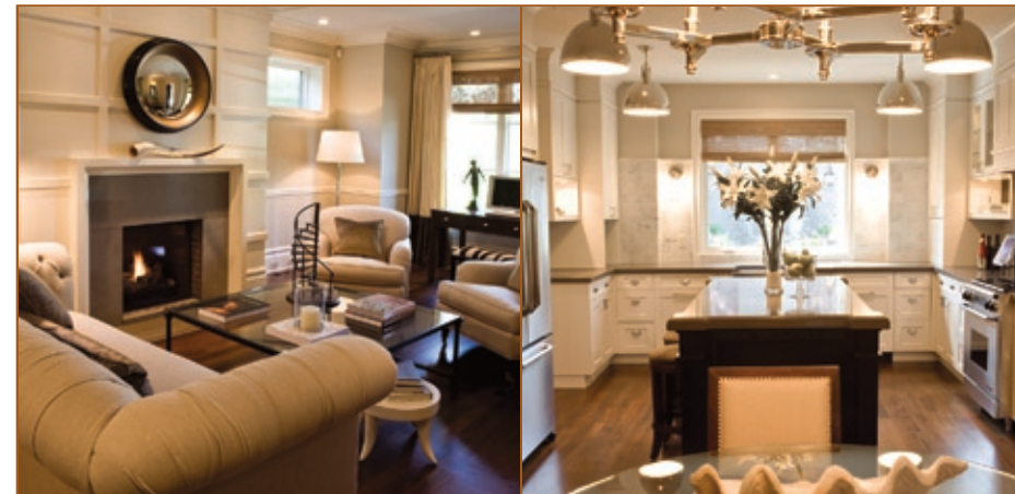
Altadore $1,450,000 1909, 48 Avenue SW