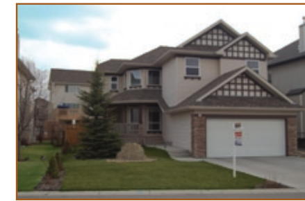
Cougar Ridge $575,000 81 Cougar Ridge View SW

2138 + 1022 s.f. 2-storey with fully developed basement! This 3 bedroom, 2.5 bath home fronts a ravine and features hardwood floors, 2-storey ceiling in great room, sprawling master suite with luxurious 5 piece jet tub ensuite. Close to parks, schools & downtown!