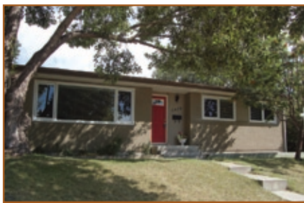
Lakeview $549,000 6428 Law Drive SW

2100+ s.f. of developed living space, sitting atop a huge pie-lot in Lakeview! 3 bedrooms, hardwood, crown moulding & island-style kitchen. Vast recreation area and 2 dens in basement. Large, private backyard with mature trees & large deck. Double detached garage & parking pad. Walk to the Glenmore reservoir!