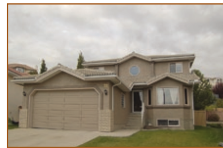
Signature Park $595,000 31 Signature Mews SW

Gorgeous 5 bedroom home situated on a pie lot in a quiet cul-de-sac. 2300 s.f. + developed basement, featuring cork flooring throughout main level, 4 bedrooms up + a 5th bedroom on the main floor, formal living & dining rooms, main floor family room + games/play room in basement.