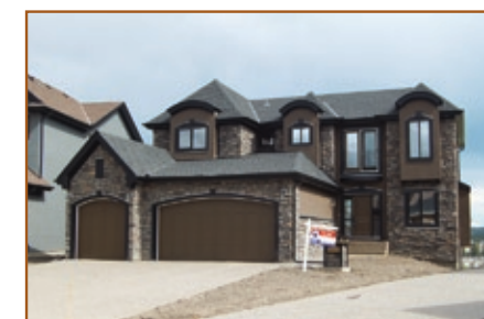
Discovery Ridge $1,495,000 30 Discovery Vista Point SW

Panoramic views! Griffiths Woods & the Rockies can be seen from nearly every room of this stunning new 4 bedroom + den, 3194 s.f. home situated atop the ridge in Discovery. Granite counters, stainless steel appliances, hardwood floors, huge master retreat & walk-out basement!