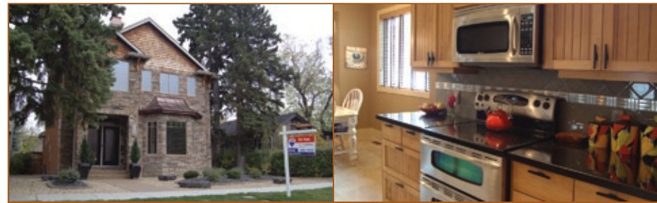
Inner City $1,475,000 1724 – 24A Street SW

Just a few minutes to downtown this executive masterpiece is situated on an extra wide 40' x 125' lot. Loaded with luxurious finishes, this 2541 s.f., 3 + 1 bedroom home boasts: professionally developed basement, spiral staircase through all 3 floors, 25' x 15' 2 tiered media room, over-sized triple garage & is just steps from off leash park, playgrounds, schools and trendy 17th Ave!