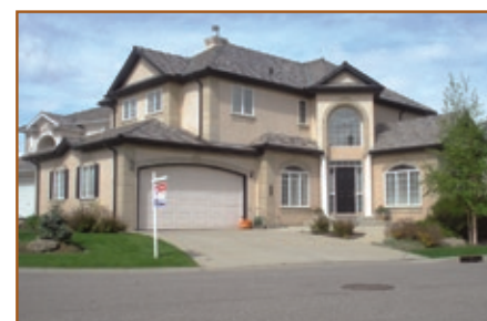
Signal Hill $825,000 101 Sienna Park Gardens SW

Fabulous curb appeal! Stunning 5 bedroom home offering 2600+ SF plus developed walkout & sweeping views, sitting atop Sienna Hill! Vaulted living room with 2-sided fireplace, island-style kitchen with plenty of prep space & large nook. Master suite boasts views, huge walk-in closet with deluxe built-in's & jet-tub ensuite.