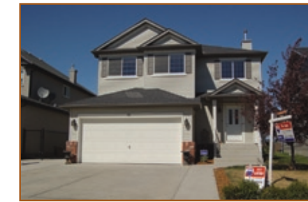
Cougar Ridge $575,000 90 Cougarstone Terrace SW

Beautiful 3 bedroom family home backing greenspace with developed basement & recent upgrades! 2059 + 803 s.f. feat. hardwood floors, soaring ceilings, formal dining room & bonus room. Large family room, beautifully renovated 3 pc bath & extensive wet bar with full fridge, freezer & dishwasher in basement.