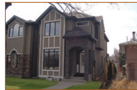
Altadore $895,000 2015 – 40th Avenue SW

"The Dorchester" boasts a fully finished basement & is located across from a school & park. Hardwood, crown moulding and kitchen with granite counters & stainless steel appliances. 3-sided fireplace in master & in-floor heating in basement! 1954 + 771 s.f. of luxury by Saddle River Custom Homes!