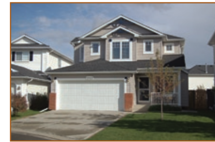
Richmond Hill $569,000 1040 Sierra Morena Court SW

1923 s.f., 4 bedrooms, 4 baths, developed basement, 2-sided fireplace & wine cellar. Recently upgraded water tank, furnace, roof & Low-E windows. This home has 2 double garages (attached & detached) - perfect for a car lover or use one as a workshop! Adorable playhouse in rear yard included!