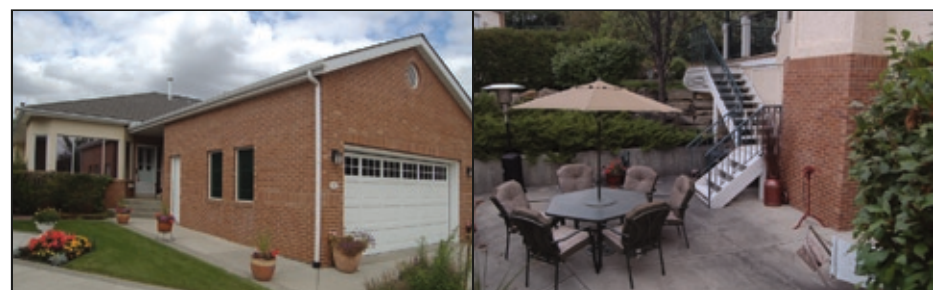
Prominence $698,000 12 Prominence Point SW

Much sought after executive bungalow villa in "The Brickburn" gated community. Bareland condo with over 1500 + 1076 s.f. Walkout basement, extensive top quality renovation: rich oak hardwood floors, elegant crown mouldings, knock down ceilings with painted borders, solid oak doors & handsome oak-encased pillars. Spacious wrap around kitchen with newer Corian countertops & appliances. Huge covered rear deck with skylights, private courtyard and double attached garage. Walk-out level boasts custom wet bar, games area, rec room with fireplace, 2nd bedroom and full bath!