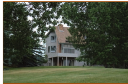
Springbank $995,000 55 Springside Street

Westhills. Possibly Calgary's most desired community. An eclectic mix of quality, elegant homes. A community well developed; well appreciated. Easy access to downtown or, out of town. Complete with shops, amenities, schools and parks.