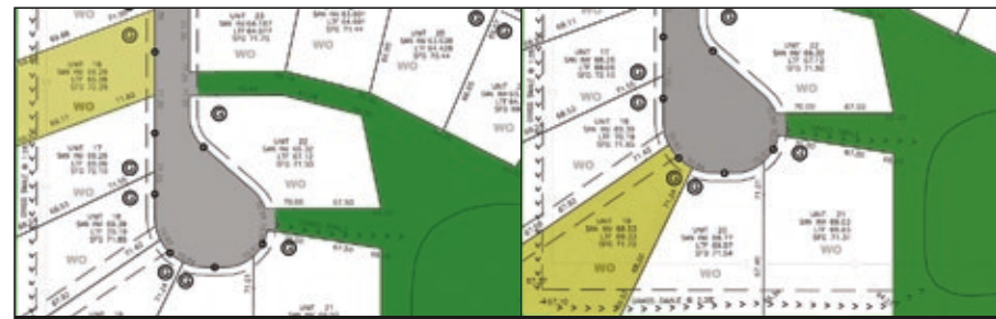
$399,000 339 Leighton View

Outstanding opportunity to own and build on either of these fabulous lots in "Elbow Valley West": both are walkout lots, and 351 Leighton View is a large pie shaped lot. This fabulous community is planned for pathways & trails, parks, playgrounds, community clubhouse & pool set before the natural backdrop of the Elbow River Valley - you are sure to be surrounded by nature at Elbow Valley West! With the purchase of this lot, you will have the freedom to select your homebuilder to create the home of your dreams. Visit the Elbow Valley West website for further information and site map of the area ( www.elbowvalleywest.com)