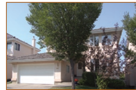
Patterson $625,000 107 Patterson Boulevard SW

Beautifully updated 4 + 1 bedroom family home with 3000+ s.f. of developed living space! Hardwood floors throughout, bright renovated kitchen with stylish granite countertops, timeless white cabinetry & stainless appliances. Spacious master retreat with jet tub ensuite! Media room, 5th bedroom, full bath & flex space in basement!