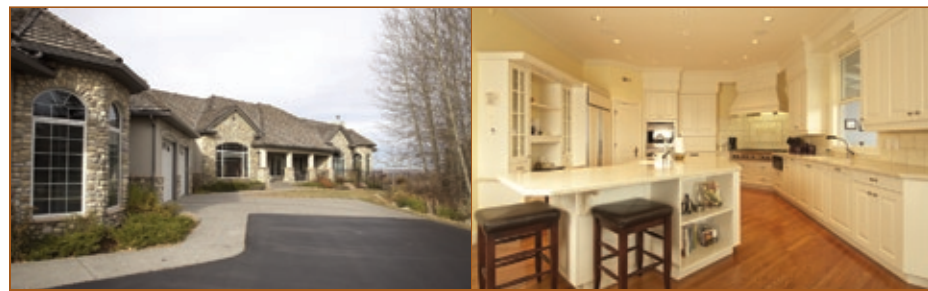
Springbank $3,200,000 53 Uplands Ridge

Perched on the ridge with fabulous Rocky Mountain views from nearly every room! 6,800+ s.f. of luxury, including 3 bedrooms, a 2 storey office featuring a 33 foot fieldstone fireplace and library in the loft. State of the art media room, gym complete with shower & spectacular wine cellar.