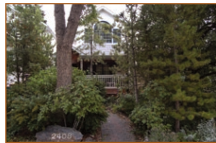
Killarney $598,000 2408 – 27th Street SW

Minutes to downtown this beautiful 2 + 1 bedroom home with fully developed basement has it all! Black pearl granite counters & walk-in pantry in the kitchen, master ensuite with jacuzzi tub, heated slate flooring, wood burning fireplace & cathedral ceilings! 1596 + 708 s.f.!