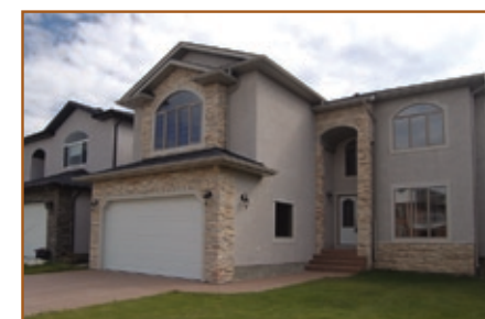
West Springs $897,000 13 West Cedar Point SW

Brand new executive family home in desirable West Springs. 2967 s.f. boasting: rich hardwood floors, soaring ceilings, crown moulding, granite counters & stainless steel appliances in gourmet kitchen. Large vaulted bonus room. Sprawling master suite with luxurious 5 piece steam shower ensuite & private veranda.