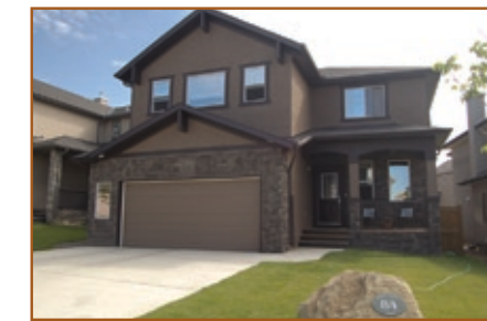
Aspen Woods $649,000 84 Aspen Stone Road SW

2361 s.f. home in desirable Aspen Woods! Features gleaming hardwood floors, open formal dining room, vaulted bonus room, gourmet kitchen with granite counters, large centre island, sunny breakfast nook & tons of storage. Master boasts his & her walk-in closets & fabulous 5 piece ensuite!