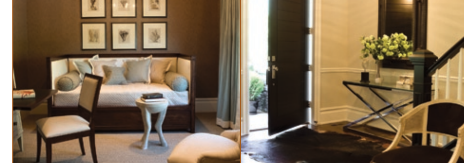
Altadore $1,450,000 1909, 48 Avenue SW

The true definition of inner-city luxury in this exceptional home built by Mission Homes. 1759 + 658 s.f. with rich hardwood floors, detailed cream millwork, built-in sound system & so much more. Master boasts coffered ceiling, walk-in closet & incredible steam-shower ensuite with wine fridge. Basement has heated floors and is developed to include media room (with built-ins), wet bar & 3rd bedroom with ensuite. Amazing patio with wood-burning outdoor fireplace.