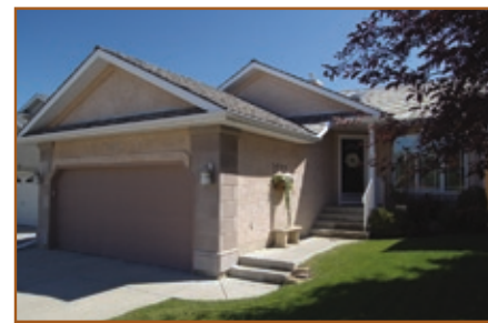
Patterson $595,000 138 Patterson Hill SW

1370 + 1076 s.f. beautifully updated 2 + 2 bedroom bungalow with developed walk-out! Rich hardwood floors, vaulted ceilings, California shutters, granite counters & more! Formal dining, vaulted great room with fireplace & gourmet's dream kitchen. Master suite with updated 3 piece ensuite. Stunning views & rear yard!