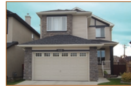
West Springs $529,000 117 West Ranch Road SW

2185 s.f. family home on a large, pie-shaped lot just steps to a local park & public transit! 3-sided gas fireplace in great room. Large bonus room, master with partial mountain views & jet-tub ensuite. Sprawling rear yard with sunny Southwest exposure.