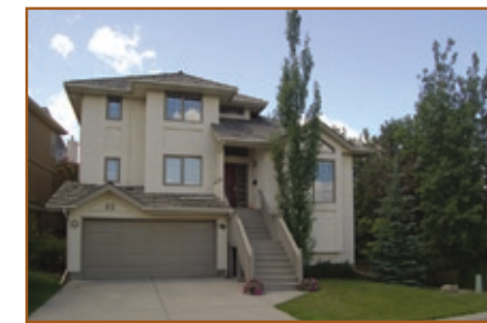
Strathcona Park $650,000 55 Stratton Crescent SW

Bright and open floorplan offers an inviting foyer and open flex space: perfect as a dining room or formal sitting area. Fabulously functional, island-style kitchen with hardwood flooring, tile backsplash, large raised eating bar and dining nook overlooking rear yard. Spacious great room features cozy gas fireplace. Master suite featuring a huge walk-in closet and 5-piece ensuite.