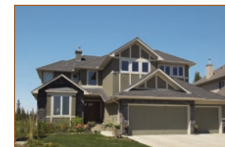
Discovery Ridge $1,295,000 30 Discovery Ridge Cove SW

Backing directly onto Griffiths Woods! Beautiful pie lot with professional landscaping, 2848 + 1212 s.f. family home, 4 bedrooms on the upper floor, with 2 more bedrooms in the developed walkout. Dark oak hardwood floors & soaring ceilings. Dream kitchen with alder cabinets, granite counters, walk-in pantry & more.