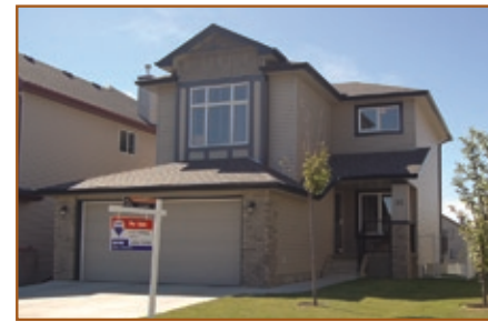
West Springs $475,000 95 West Springs Close SW

Beautiful 2 storey, 3 bedroom, 1748 s.f. family home in desirable West Springs! Close to schools, parks & playgrounds, and a quick commute to downtown. Island-style kitchen with stainless appliances, large bonus room, convenient main floor laundry, large deck with gas line & patio in lovely rear yard.