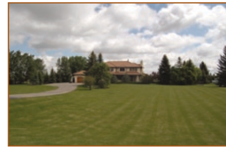
Springbank $1,195,000 64 Springland Way

2 acres of gorgeous land in Springbank, this 3112 s.f. + developed basement, 6 bedroom + den, 2-storey home has more than enough room for any family. Find plenty of play space outside & in the fully developed basement! Solarium with sunken hot tub & luxurious master retreat!