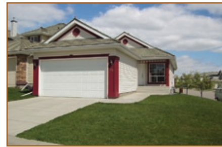
Springbank Hill $439,000 42 Spring Crescent SW

3 bedroom, 1118 s.f. bungalow situated the corner lot of a quiet street! Gleaming hardwood floors, kitchen with classic white cabinetry & bright dining nook with access to large rear deck. Spacious master overlooks the rear yard. Steps to playground & green space & minutes to downtown!