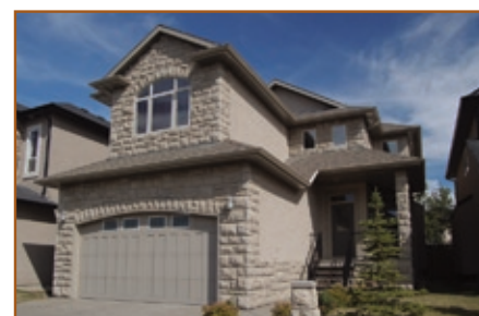
West Springs $825,000 6 West Cedar Place SW

Executive home in West Springs with beautiful finishings & fabulous curb appeal! Over 3400 s.f. of developed living space featuring: 4 + 1 bedrooms, jetted shower & jet-tub in master retreat, premium stainless steel appliances & granite counters in kitchen, main-floor laundry & masterfully developed basement!