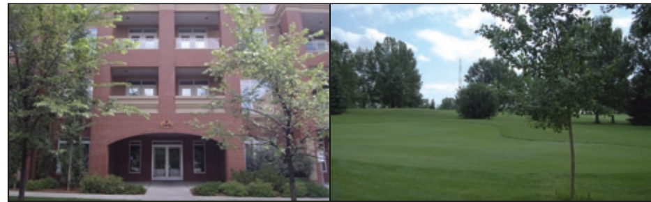
Copperwood $375,000 #1104, 24 Hemlock Crescent SW

1083 s.f. executive condo overlooking Shaganappi Golf Course! Open, bright floorplan featuring a stylish, wrap-around kitchen with chic Corian countertops, easy care slate tile backsplash & breakfast bar. Spacious dining with hutch niche & sprawling great room with dramatic feature wall featuring slate tile facing & cozy fireplace. Private patio with, large master retreat & 5 piece ensuite. Titled, underground parking & fabulous amenities including a club house with rec room, complete with pool table, air-hockey table, meeting rooms & fully serviced gym. All of this just minutes to the downtown core!