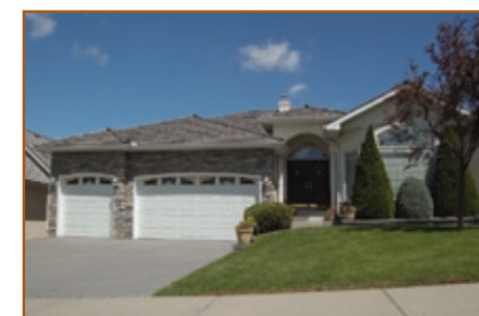
Patterson $950,000 198 Patterson Boulevard SW

2021 + 1663 s.f., 4 bedroom bungalow with stunning views & developed walk-out! California shutters, granite counters & 3 skylights in kitchen, 3-sided fireplace shared between nook, great room & kitchen. Master retreat with fireplace, gorgeous view of river, His & Her walk-in closets & 5 piece jet-tub ensuite.