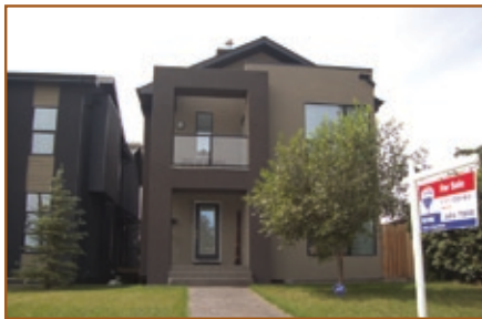
Altadore $995,000 4927 – 21st Street SW

Exceptional contemporary style 2463 s.f. infill on a large lot boasting high-end finishes: granite counters, gleaming hardwood floors, limestone tiles & very chic urban style. 3 bedrooms, master retreat with huge walk-in closet & private balcony, sunny west backyard with extensive patio: perfect for outdoor entertaining!