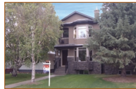
Killarney $795,000 3018 – 27th Street SW

New home! Executive attached home with developed basement & double garage. 2800+ s.f. with granite counters, Grohe fixtures & vaulted master with rain shower and extra-deep, jetted soaker tub with water heater! 3 amply scaled bedrooms upstairs & developed basement with wet bar, games room & 4th bedroom.