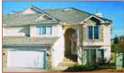
59 Scimitar View, NW $295,000 SCENIC ACRES WALKOUT VILLA

Like new! Well designed & richly appointed bi-level style attached home with lower level walkout basement. Excellent location, quiet crescent with large single family homes and siding onto a greenbelt with walking pathway system. Finishing details incl. vaulted ceilings, skylights, richly stained oak millwork, hardwood flooring, cornice mouldings, raised panel doors, oak built-ins, double sided gas fireplace, den with double French doors & built-ins, white island kitchen, 2 BR & 2 full baths, designer window coverings. Ready now, nothing to do but move in!