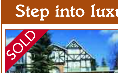
1037 Premier Way SW $734,900 ELBOW PARK/MOUNT ROYAL

Stunning executive attached home in an ideal location backing onto the golf course & with lake and fountains view. Immaculately kept, like new, walkout bungalow with 12' ceilings, cornice mouldings, white millwork, 8' raised panel doors, rich maple cabinetry, granite countertops in kitchen & bathrooms, stepped ceiling, skylight, open curved staircase, maple flooring, exquisite light fixtures, furniture quality built-ins, huge windows and top of the line appliances. Offers 1660' on the main + 985' in the walkout, 1 bedroom & den up, 2nd bedroom, billiards room & rec room down. Very elegant finishing throughout with tranquil lake views from living room, kitchen, Master bedroom & walkout.