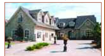
20 Heritage Lake Blvd. $1,250,000 ON THE LAKE AT HERITAGE PT.

Elbow Valley, gracious & beautifully appointed 4440 sf tudor style 2 storey plus fully developed basement for a total of almost 5800 sf of luxurious living space! Offers a total of 4 BR + den & bonus rm (large enough for an extra 2 BR & full bath), high ceilings on all 3 levels, circular foyer w/ grand sweeping stairway, 9" high baseboards, cornice mouldings, antiques cabinetry, granite counters & vanities, limestone & brazilian cherry flooring, 4 fireplaces, extensive wainscoting and numerous furniture quality built-ins. Oversized garage, large west backyard.