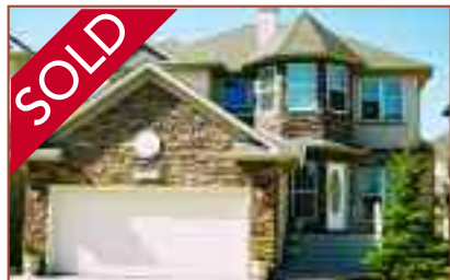
93 Strathridge Close SW $334,900 SPRING HAVEN, QUIET CUL-DE-SAC

Beautifully designed, gently used, one owner home in desirable "Hamptons" backing onto the golf course and ravine with panoramic city & countryside views from all 3 levels!† 3511 sq. ft. 2 storey + fully developed walkout basement & triple attached garage, finishing details include ivory millwork, plush carpeting, antiques cabinetry, granite countertops, maple built-ins, open string curved stairway, main floor den, huge gourmet kitchen, a total of 5 bedrooms (3 w/ full ensuite bathrooms) and master suite with 2 walk-in closets, huge bow window to enjoy views.