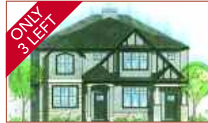
529-34 Street NW $319,900 NEW PARKDALE TOWNHOMES

Cidex built, 2280 sq. ft. 2 storey, the best price in desirable Spring Haven, close to shopping, Westside Recreation Centre & a quick commute to downtown! This home offers vaulted foyer with open curved stairway, formal dining room with pillared entryway, formal living room with cathedral ceiling & full height palladian window, white kitchen with centre island & pantry, main floor family room w/ gas fireplace, main floor den plus 3 upper bedrooms including master suite w/ jetted tub ensuite. Your personal touches will make this a lovely home!