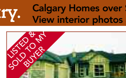
63 Discovery Valley Cove SW $869,000 BACKING ONTO THE RIVER

Custom built in 1987 and with extensive renovations including the finest Empire kitchen with white cabinets & granite counters this spacious Elbow Park home offers over 2600 sq. ft. of living space with 3 bedrooms, wrap around loft ideal as home office, music room + developed lower level with 3000 bottle wine cellar. Features several built-ins, hardwood & imported Italian marble flooring, and beautifully landscaped south backyard. Huge oversized double underdrive garage with large deck above. Fast possession available.