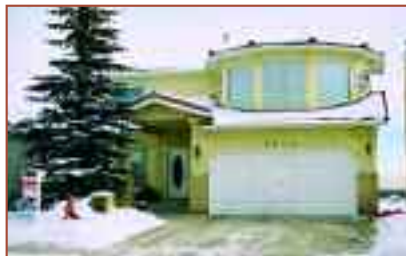
2856 Signal Hill Drive, $395,000 PANORAMIC VIEWS, DEVELOPED WALKOUT

Bright & cheery 2 storey w/ beautiful west backyard in desirable Spring Haven. Finishing details include 9 foot high ceilings, soft-line drywall corners, white millwork, double beveled glass French doors into formal dining room, maple & iron stairway, hardwood & ceramic flooring, maple cabinetry and calming neutral décor. This 1935 sq. ft. home offers open great room with 3 way fireplace shared with kitchen & nook, 3 upper bedrooms including spacious master suite w/ bayed sitting area & luxurious ensuite w/ jetted tub & his/hers vanities.