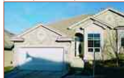
4536 Hamptons Way NW $449,000 BACKING THE GOLF COURSE

Signal Hill. Renovated 3 bedroom 2 storey with upper bonus room and fully developed walkout basement.† Set on the ridge with panoramic views to downtown this spacious 2677 sq. ft. home offers a total of over 3700 sq. ft. of living space.† Upgrades include hardwood flooring throughout main floor, up to and including bonus room, newer carpeting, countertops, appliances, 2 gas fireplace inserts, air conditioning, blinds, Plexiglas deck surround and more. Walkout development includes rec room w/ granite faced f/p, wet bar, den or 4th BR & full bath.