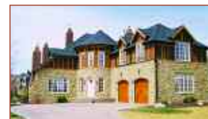
23 Snowberry Gate $1,090,000 CLASSIC TUDOR STYLE

Fabulous open planned hillside bungalow on a 1/2 acre lot with panoramic Rocky mountain views from both main & walkout level! This 2241 sf home offers over 4000' of high end development with 9 & 11 foot high ceilings, cornice mouldings, rich cherry cabinetry & bookcases, granite counters & vanities, extensive hardwood & heated slate & limestone flooring and huge windows to enjoy the views. Include 2 Br on main + fully dev'd walkout includes extensive built-ins in games room, family room, huge spa-like bathroom, home office.