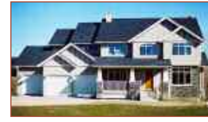
25036 Briarwood Drive, $725,000 BEARSPAW, 2 ACRE PARCEL

The perfect home for a large family! This well built 2 storey offers almost 5000 sq. ft. of living space including fully developed walkout basement, with a total of 6 bedrooms (all large & w/ walk-in or oversized closets), den and full sized 2nd kitchen. Features extensive hardwood & marble flooring, rich oak woodwork, foyer with grand switchback stairway and impressive chandelier, and wrap around deck to enjoy the downtown views. All rooms on a grand and traditional scale including formal living, formal dining & main floor family room.