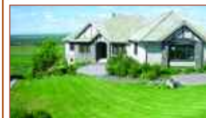
29 Slopes Road SW $895,000 WALKOUT BUNG., SUPERB VIEWS

Superb location, set on a 60' x 215' deep lot, high on the escarpment with unobstructed & panoramic city & river valley views from all 3 levels! This 3180 sf 2 storey offers 4 BR + main floor den, fully dev'd walkout w/ nanny suite + triple garage. Features open curved staircase, formal living & dining rooms, huge kitchen & eating area w/ hardwood flooring & large centre island overlooking the beautiful backyard & views & opening to a full width deck w/ Plexiglas surround, Master bedroom has a fireplace shared with the ensuite bathroom.