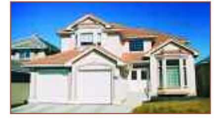
101 Hamptons Circle NW $769,000 GOLF COURSE, PANORAMIC VIEWS

Exceptional shaker style new home set on a 2 acre lot, backing into the trees, in Bearspaw. This thoughtfully designed family home offers 4247 sq. ft. of total development including walkout basement with a total of 5 bedrooms and 2 dens. Features a large kitchen w/ white cabinets & granite counters, huge walk-in butler's pantry, hardwood floors & nook w/ wrap around windows, formal dining room w/ stepped ceiling, living room w/ 2 storey height ceilings, granite faced fireplace & tranquil view of the woods. Triple attached garage.