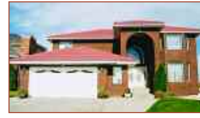
132 Christie Park View SW $679,000 CHRISTIE ESTATES, CITY VIEWS

Super location, close to river, U of C, and the new Children's Hospital! Classic Georgian style 2 storey townhomes built by prominent upscale developer. Average size is 1327 sq. ft. with option for fully developed basement. Features 9 foot ceilings, gas fireplace, 2 bedrooms, 2 baths, custom upscale finishings incl. hardwood flr, granite counters, maple cabinets, stainless steel appliances, designer mouldings & built-ins. Landscaped yards & single garage. Ready for occupancy this spring, still time to choose your colors and the unit of your choice if you call immediately!