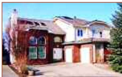
32 Patterson Mews SW $599,000 BACKING PARK, CITY VIEWS

Redesigned and totally renovated in the past 3 years! This 2200 sq. ft. bi-level includes a fully developed walkout basement, city views and 4 car attached garage. Features extensive dark hardwood and slate flooring with in-floor heat, incredible rich maple kitchen w/ granite covered centre island and adjoining butler's pantry with extra cabinetry & 2nd dishwasher, 2 BR on main incl. master w/ gas fireplace & 5 piece ensuite w/ heated flooring, beautifully developed walkout w/ 2 more BR, home office, family room and mirrored workout area.