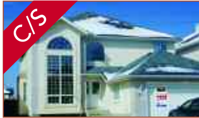
1481 Strathcona Drive SW $299,000 LOWEST PRICE, SPRING HAVEN

Like new! Well designed & richly appointed bi-level style attached home with lower level walkout basement. Excellent location, quiet crescent with large single family homes and siding onto a greenbelt with walking pathway system. Finishing details incl. vaulted ceilings, skylights, richly stained oak millwork, hardwood flooring, cornice mouldings, raised panel doors, oak built-ins, double sided gas fireplace, den with double French doors & built-ins, white island kitchen, 2 BR & 2 full baths, designer window coverings. Ready now, nothing to do but move in!