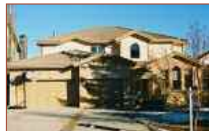
88 Patterson Drive, SW $669,000 SPECTACULAR VIEWS

Prominence Point, exclusive cul-de-sac, executive 2 storey, 3200 sq. ft. + fully developed walkout basement offering almost 4500 sq. ft. of custom designed living space. Features high ceilings with numerous skylights, 4 fireplaces, granite and ceramic flooring, granite counters, white cabinets, curved stairway, 4+1 bedroom + den and loft. Walkout developed with enclosed spa with hot tub, rec room and games room with wet bar. Triple garage. Wonderful location backing park, fronting treed island, and with downtown views.