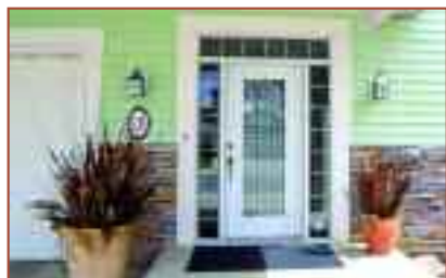
28 Patterson Rise, SW $525,000 STUNNING,RENO'D BUNGALOW

Never lived in, former showhome, just minutes from Crowfoot shopping mall and both backing and siding onto the golf course at Lynx Ridge. Exquisitely appointed bungalow with fully developed walkout basement, 2498 sf on main, 2+3 BRs + main floor den, extensive maple flooring, high ceilings, French doors, classic columns, dream kitchen with granite countertops, walkout development includes media room, billiards room w/ wet bar & 3 BRs. Includes it's own private outdoor sports court ideal for tennis or basketball, triple garage.