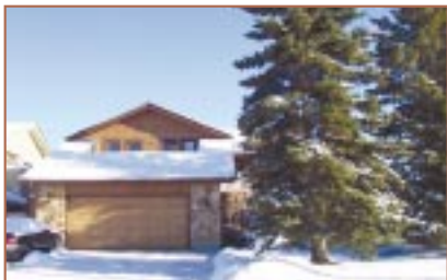
560 Coach Grove Road, SW $389,900 COACH MANOR ESTATES, CITY VIEWS

Spring Haven, terrific 3 bedroom bungalow offering over 1800 sq. ft. of living space on the main floor plus developed basement with 4th bedroom & den. This home has a south backyard and views of the ravine from the large rear deck. Features upgraded carpeting, tile, decorative archways, wrought iron railings, granite faced fireplace and beautiful kitchen with maple cabinetry, granite countertops, centre island, under cabinet lighting, pantry with French door & upgraded stainless steel appliances. Ready for immediate possession!