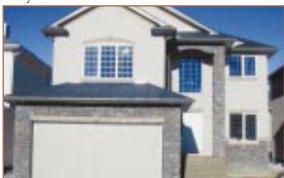
57 Strathlea Close SW $409,000 NEW HOME, IMMEDIATE POSSESSION

Just listed, available for quick possession! Beautiful former Cidex showhome offering 2400 sq. ft. of living space and charming curb appeal with wrap around verandah. Features extensive hardwood flooring, designer kitchen with maple cabinets, granite counters, mosaic tile backsplash, 10' long island, 2 wine racks & decorative display drawers plus nook with windows on 3 sides. Great rm plan with upper bonus room and 3 bedrooms. Finished walkout basement with 4th bedroom, family room with fireplace, full bathroom.