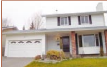
5812 Dalcastle Cres. NW $299,900 UPATED 4 BEDROOM HOME

21st floor penthouse unit on the Bow River with north and West facing window walls offering spectacular views of the river, Shouldice Park and the north hill! Plan offers 1200 sq. ft. with 9' ceilings, atrium, wood burning marble faced fireplace, 2 bedrooms & 2 bathrooms, in suite laundry and storage and kitchen with marble countertops. Includes double underground parking and 2 one year "gold" Riverside health Club memberships in the complex with pool, gym, squash, tennis and dining room facilities all at your feet!