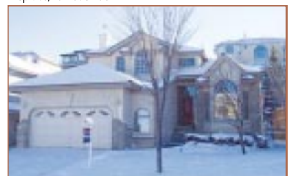
123 Patterson Drive, SW $439,900 DRAMATIC 2 STOREY, QUIET STREET

Beautifully appointed & immaculately kept Cidex-built home with excellent curb appeal! Ideally located on quiet cul-de-sac just minutes to downtown & west side services. Very open plan with large foyer, main floor den with French doors, Great room & formal dining room, spacious walnut toned kitchen with suede look countertops, 3 bedrooms & upper bonus room (also ideal as a very large 4th bedroom) including beautiful master suite with sitting area & luxurious jet tub ensuite bathroom!