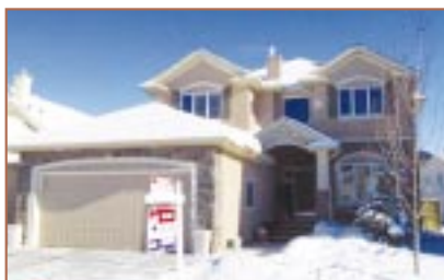
26 Strathlea Grove SW $415,000 SPRING HAVEN BETTER THAN NEW!

Just listed, Spring Haven, quiet cul-de-sac location. Newly completed 2638 sq. ft. 2 storey with 3 bedrooms, main floor den and upper bonus room. Features rich brazilian cherry flooring throughout main floor, white millwork, 9 foot ceilings, den with double French doors, formal dining room with classic columns, 2 storey great room, beautiful kitchen with natural maple cabinetry and granite countertops, 3 upper bedrooms including master with his/hers walk-in closets and luxurious jet tub ensuite bathroom.