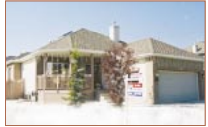
1408 Strathcona Drive, SW $349,900 3 BDRM BUNGALOW, RAVINE VIEWS

Excellent location, quiet crescent near tot lot in West Dalhousie! This large 2 storey is ideal for a growing family as there are 4 upper bedrooms and an extra large family room on the main floor. Offering 2055 sq. ft. of updated living space including new hardwood throughout main floor, on stairs and throughout upper floor, new ceramic tile in entry and bathrooms, fresh paint throughout and kitchen updated with new countertops & centre island. Double attached garage, large backyard. Available immediately!