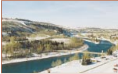
80 Point McKay Cres. NW $259,900 BREATH TAKING VIEWS

21st floor penthouse unit on the Bow River with north and West facing window walls offering spectacular views of the river, Shouldice Park and the north hill! Plan offers 1200 sq. ft. with 9' ceilings, atrium, wood burning marble faced fireplace, 2 bedrooms & 2 bathrooms, in suite laundry and storage and kitchen with marble countertops. Includes double underground parking and 2 one year "gold" Riverside health Club memberships in the complex with pool, gym, squash, tennis and dining room facilities all at your feet!