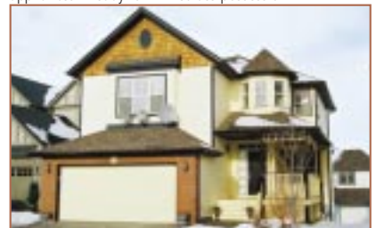
48 Cougar Ridge Heights SW $399,900 FORMER SHOWHOME, WALKOUT BSMT.

Just listed Edgemont Estates, recently renovated 2 storey Split, offering almost 2500 sq. ft. of luxurious living space! This home is set on a pit lot in a quiet location with mature trees and backing onto a 10 acre park. Features all new ceramic tile, carpeting and fresh paint with 3 Bedrooms & den, 4 bathrooms, indoor pool & hot tub. Assumable mortgage of $352,000 with payments of $2067 P/M - only $47,000 down! Immediate possession!