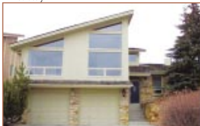
56 Edgehill Rise NW $399,900 $47,000 DN TO ASSUME MORTGAGE

Across from a treed island in desirable Coach Manor Estates. This 2 storey home offers 2750 sq. ft. of living space plus developed basement. The large corner lot will accommodate RV parking, has a 2 tiered deck, enclosed front courtyard and still has plenty of space for the hobby gardener. Features foyer with dramatic open curved staircase, formal living & dining rooms with shared 2 way stone fireplace and hardwood flooring throughout foyer, formal dining room, kitchen, eating nook and main floor family room.