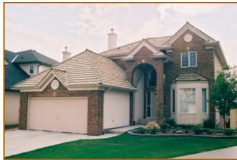
Sienna Park $495,000 327 Sienna Park Bay, SW

Bright & beautiful new home set on a pie lot w/ sunny south backyard & adjoining walking path! This home is walking distance to Westside Rec. Centre & a quick commute to downtown, offering 3 BR + huge upper bonus room. Features Brazilian Cherry hardwood flooring, granite counters, maple cabinetry (some with glass fronts) & built-ins, 2406 s.f., undeveloped basement with large windows.