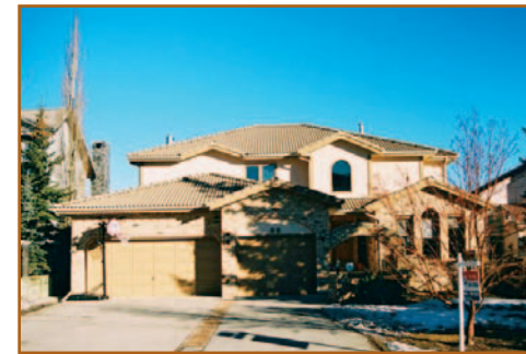
Patterson $659,000 88 Patterson Drive, SW

Walkout bungalow with full wall of windows to enjoy the tranquil views into the south backyard, natural treed greenbelt & Griffiths Woods Environmental Reserve! This 1536 sq. ft. bungalow w/ developed walkout offers almost 2700' of development! Contemporary elegance w/ deep toned hardwood floors, clean lined built-ins & sleek Kitchen w/ granite countertops. 2 BR & den.