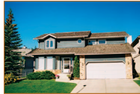
Strathcona Park $339,000 195 Strathaven Circle, SW

A wise investor said to "buy the lowest price home on the nicest street possible" and here's your chance! Surrounded by $500,000+ homes this 3 BR 2107' 2 stry has a lovely west yd w/ gorgeous (& expensive!) stone patio. Grand foyer w/ high ceilings, skylight, hardwood floor, formal DR w/ pillars, white kitchen w/ island & separate telephone desk/eating bar, wonderful mtm view from upper BR.