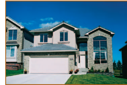
The Hamptons $525,000 4642 Hamptons Way, NW

Former Cidex-built showhome, 2306 sq.ft. 2 storey, soaring 2 storey height ceilings, windows & built-ins in Great Rm, rich dark hardwood & elegant tile flooring, main floor den & formal dining room, gorgeous kitchen with granite countertops, eating nook w/ windows on 3 sides looking out to the beautifully landscaped backyard with huge deck, 3 upper BR, designer window coverings.