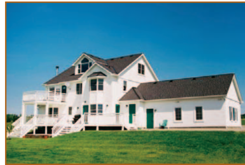
Springbank $719,000 24152 Range Road 31A

Beautifully designed and finished, Shaker-style country residence, 3271 sq. ft. 2 storey + fully developed walkout basement. Plan offers den with built-in bookcases & knotty pine paneling, 2-storey living room with granite-faced fireplace, maple flooring & tranquil view of the woods, gourmet's kitchen w/ granite counters, 4 BR, walkout w/ games room, wet bar & 5th BR.