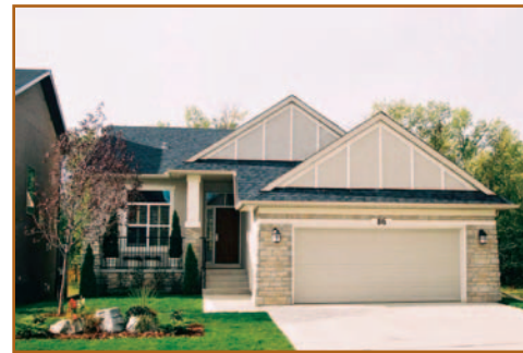
Discovery Ridge $599,000 86 Discovery Ridge Boulevard, SW

Exquisitely upgraded Georgian style 2 storey w/ full brick exterior! 2675' + developed basement, 4+2 BR, sweeping curved stairway, high end California shutters, rich oak flooring, white kitchen w/ granite counters open to family room w/ brick f/p, beautiful formal sitting room & formal dining room with French doors, ivory millwork, cornice mouldings & designer paint colors!