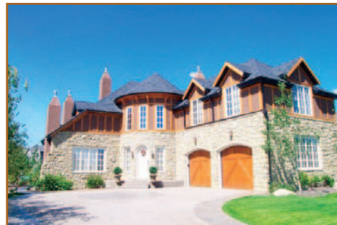
Elbow Valley, $995,000 23 Snowberry Gate

Incredible 4.5 acre lot with fantastic landscaping featuring ponds, waterfall, extensive patios, camp-fire area, children's playground, mature trees, barn & fenced livestock pens! Huge ranch style home offering 3836 s.f., up + fully developed walkout for a total of almost 7000 s.f. of living space w/ 7 BR + loft/office with high ceilings & windows, master suite w/ private deck & hot tub, oversized triple garage.