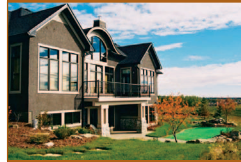
Elbow Valley $950,000 123 Winding River Rise

Both backing & siding onto the golf course! This 2498 + 2060 s.f. former showhome has a developed walkout, triple attached garage and its own sport court (tennis or basketball) in the south backyard. Features extensive inlaid hardwood flooring, island kitchen w/ granite countertops, main floor den, walkout level media room & billiards room, 2+3 Bedrooms, 2 fireplaces, 4 baths. Immediate possession available!