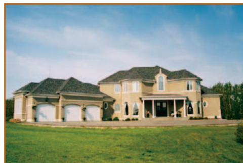
Bearspaw $1,275,000 7 Cheyenne Meadows Way

Backing onto a greenbelt and into a grove of aspen trees this exquisitely finished 3532 s.f. 2 storey offers a fully developed walkout basement (over 5500 s.f. of space) + triple garage, 4 BR, 2 dens, amazing kitchen w/ distressed French Country style cabinetry, granite counters, furniture quality built-ins, limestone & hardwood flooring, coffered & vaulted ceilings, $50,000 spent on sandstone exterior alone!