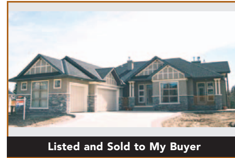
Listed and Sold to My Buyer

What a location, this 2380 s.f. 2 storey with fully developed walkout basement is ideally set on a lot that is both backing & fronting onto the golf course! Offering 3180 s.f. of luxurious living space with 4+1 BR and den and featuring soaring 2 storey height ceilings & beautiful built-ins in family room, formal LR & DR, island kitchen w/ stainless steel appliances & granite counters, wonderful views, shows like a dream!