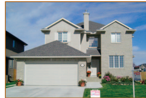
Strathcona $419,000 1581 Strathcona Drive, SW

Just steps to public & separate elementary schools in much sought after Strathcona Park, on a quiet crescent backing west onto a park! 2404' 2 storey with 4+1 BR, main floor den, hardwood thru most of main floor, vaulted Family Room, European kitchen w/ island & hardwood floor, formal LR & DR, basement developed w/ 2nd family room/billiard room, 5th BR & full bathroom.