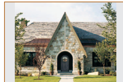
Stone Pine $2,750,000 43 Granite Ridge

Exquisitely appointed executive home on 3.4 acres in "Church Ranches". This 4542 s.f. 2 storey features grand foyer w/ sweeping limestone staircase, huge central great room, elegant dining room, beautiful library, heated limestone flooring, gourmet kitchen w/ antiqued & ivory cabinetry, butler's pantry, main floor master suite w/ unsurpassed ensuite, 3 upper BR incl. one in it's own private wing, fully developed walkout, over 7200 s.f. developed!