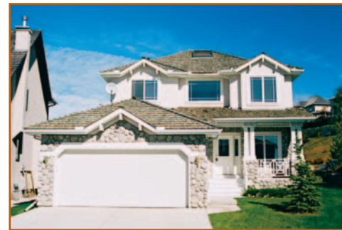
Sienna Park $329,000 27 Sienna Ridge Bay, SW

Backing onto a greenbelt! This 2092' 2 Storey is set on a quiet crescent backing west onto a greenbelt & walking path. It's an open, Great Rm plan w/ hand plastered "tray" ceiling, gas fireplace, switchback staircase, island kitchen with rich cherry stained cabinetry, main floor den, 3 upper BR + open upper loft area, developed basement w/ family room & adjoining den or bedroom + full bathroom.