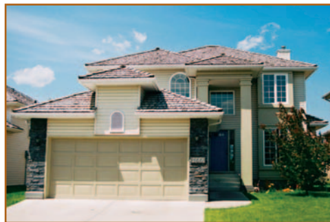
Richmond Hill, $319,000 144 Sierra Madre Crescent, SW

Bright & well kept 2 storey on cul-de-sac with nicely landscaped south backyard! This 1900' 2 st. offers 3 BR + large upper Bonus Rm w/ bay window. It's an open plan w/ Great Room w/ corner fireplace, formal Dining Rm, white island kitchen, extensive ceramic flooring, patio doors open to huge 2 tiered deck, easy care yard. Developed basement w/ Rec Rm, room for 2 more BR & lots of storage.