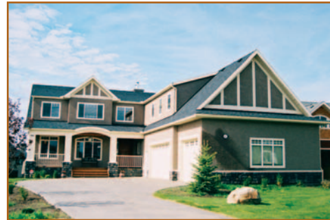
Elbow Valley $895,000 207 Winding River Point

Named "Best New Community in Canada 2004"! Wonderful 3631' 2 storey backing onto a greenbelt, like a show-home with high ceilings, cornice mouldings, ivory millwork, antiqued cabinetry, granite counters & vanities, maple floors, huge butler's pantry, den w/ built-ins, fabulous laundry & sewing room, Bonus Rm, vaulted Master Suite w/ fireplace shared w/ ensuite, 2 more BR w/ Jack & Jill ensuite.