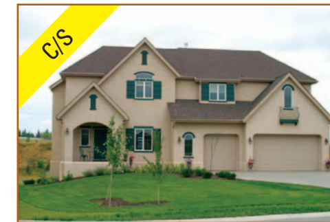
Elbow Valley $798,000 104 Whispering Woods Terrace

Incredible new home on a lovely, rolling 4 acre parcel backing east into the woods! This hillside bungalow offers 2471' on the main floor with an additional 1534' dev'd in the walkout basement. Open, plan, high ceilings, rustic arts & crafts style home w/ 10'-14' high ceilings, rich cherry cabinetry & flooring, granite counters and vanities, 2+2 BR & den, triple attached garage.