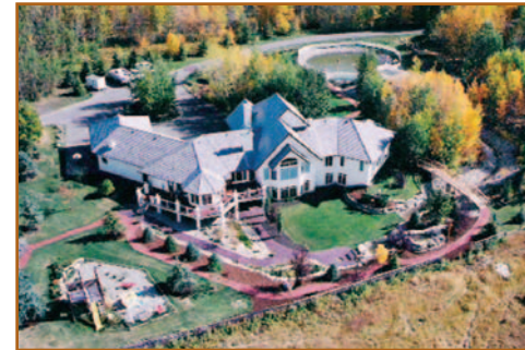
Bearspaw $995,000 12 Woodland Rise

The views are incredible! This spectacular custom built bungalow is set on 8.3 acres, high on the hill with panoramic Rocky Mountain views. Offering 3309 s.f. on the main floor plus upper observatory w/ an additional 3358 s.f. developed in the walkout basement, 1+3 BR, main floor den, walkout level media room & Billiards room, high ceilings (9' to 20' high), oversized triple garage w/ workshop.