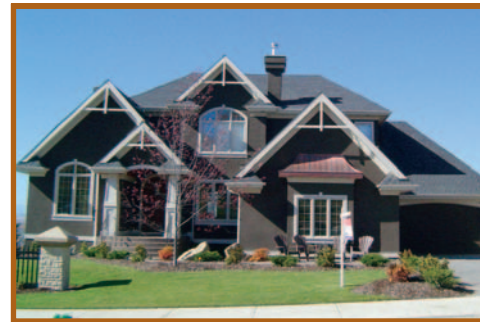
Spring Valley Estates $829,000 3371 77 Street, SW

You must see the spectacular Elbow River Valley & Rocky Mountain views from both levels of this new hillside bungalow! 2585 s.f. on the main floor + dev'd walkout basement for a total of 4400 s.f. with a total of 5 bedrooms, open plan main floor w/ den, great room, island kitchen, master BR w/ fireplace, lower games room & media room, huge 20' long front deck with Plexiglas surround, triple underdrive garage.