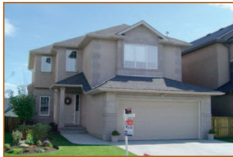
Strathcona $449,000 14 Strathlea Crescent, SW

Bright & airy 2014 s.f. bungalow with fully developed walkout basement & triple garage. Ideal location in prestigious gated community, backing south onto Griffiths Woods Environmental Reserve and the river. Features high ceilings, arts & crafts style décor, maple cabinetry & flooring, granite countertops, 3 fireplaces (including one woodburning fireplace outside on the deck ), 3 BR & main floor den.