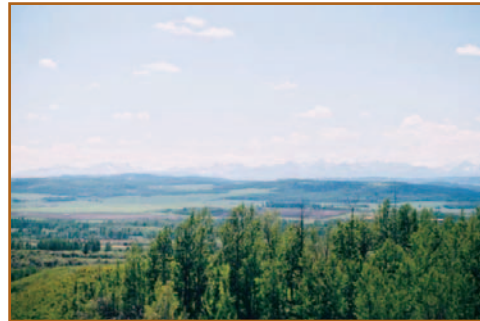
30 Minutes to Calgary $975,000 160th Street West

Almost 5500 s.f. of luxurious living space! This nearly new 2 storey offers over 4000' above grade + 1455' in the developed walkout basement (with a full kitchen and separate entryway ideal for nanny or mother-in-law). Finishing details include high ceilings, open string staircase ivory millwork, maple cabinetry & built-ins, 2 steam showers, 3 stone fireplaces, 4 BR, den & bonus room!