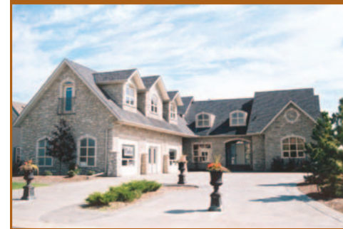
Heritage Pointe $1,250,000 20 Heritage Lake Boulevard

Award winning former showhome, backing onto the lake in Elbow Valley! This 2345 s.f. bungalow has 4 bedrooms and a fully developed walkout basement. Very bright & spacious open plan with polished limestone & cherry flooring, wrought iron railings, open beam ceilings, huge kitchen w/ cherry cabinetry & granite countertops. Triple attached garage & your own private dock.