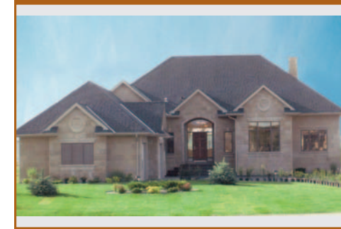
Lynx Ridge $875,000 106 Lynx Meadows Drive

Large estate home on beautifully landscaped 1/3 acre lot ideally set high on the escarpment with unobstructed & panoramic city & river valley views! 3180' 2 stry + fully dev'd walkout offering 4+1 BR & den w French door, nanny suite in the walkout, entertaining sized rooms throughout, huge kitchen w/ hardwood floors, family Rm w/ high ceilings, 215' deep lot backing to the ravine.