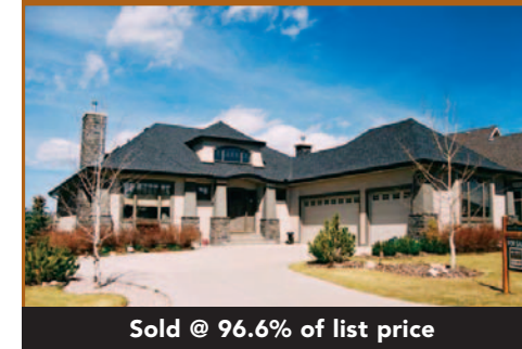
Sold @ 96.6% of list price

11' high ceilings. this 3530 s.f. 2 storey has a 4 car garage, partially developed walkout basement, air conditioning, in-floor heat in bathrooms & walkout, granite countertops & vanities, antiqued maple & cherry cabinetry, 4 Bedrooms, den & bonus room.