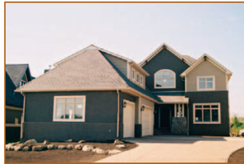
Elbow Valley $769,000 119 Winding River Rise

3.88 Acres, just minutes from West Hills shopping & a quick commute to downtown, perfect for horse/nature lovers! A gorgeous fenced parcel w/ panoramic mountain views, 3650' 2 stry, built in 1998 but designed to reflect turn-of-the-century grandeur, 5 BR+Bonus Rm, neutral décor w/ rich hardwood floor, wainscoting, cornice mouldings, French doors, wonderful country sized kitchen.