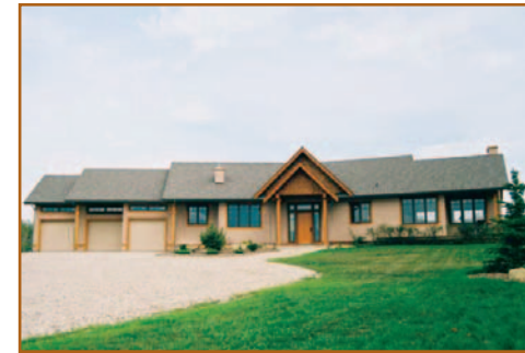
Bearspaw $795,000 31189 Woodland Way

A charming country home! This 1985' bungalow has a fully developed walkout basement for a total of almost 4000' of living space + a triple attached garage! It's an open plan with a huge formal dining room, gable vaulted Great Rm w/ fireplace & large windows to enjoy the tranquil views over the greenbelt, master BR w/ clawfoot tub in ensuite + 2nd BR w/ full ensuite, 2 more BR down.