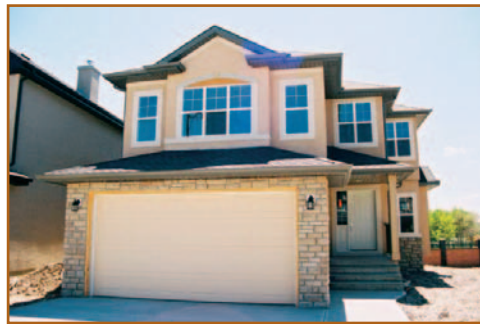
Springborough $449,000 157 Springborough Green, SW

This one has it all! Beautiful 2 storey with 3+1 Bedrooms, upper Bonus Room, fully developed "daylight" basement (huge windows, almost a walkout basement) and fully landscaped & fenced south backyard! This Cidex-built home offers extensive hardwood flooring, stairways with iron railings, island kitchen w/ eating bar & wonderful walk-thru butler's pantry.