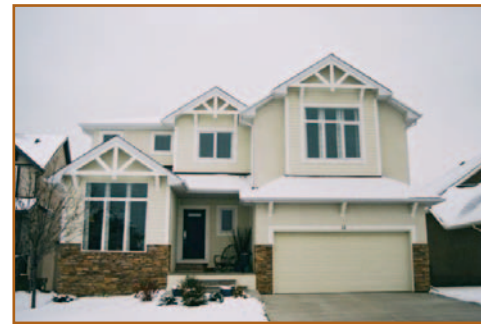
Discovery Ridge $535,000 12 Discovery Ridge Rise, SW

Cul-de-sac location walking distance to parks, skating rink & elementary school! 2335' 2 storey with fully developed walkout. Offering 3+1 Bedrooms & 2 dens, rich oak cabinetry & granite counters in the kitchen, huge Master Bedroom & adjoining sitting room w/ 3-sided fireplace that opens to the foot of the jetted tub in the ensuite, beautiful pie lot w/ pond, outdoor fireplace & heritage stone patios.