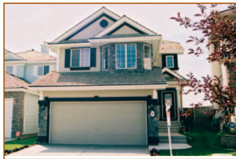
Springbank Hill $289,000 50 Spring View, SW

Absolutely charming 3 Bedroom 2 stry set on a quiet crescent, backing onto a greenbelt with a walking path, the perfect location for a young family! Features main fir den, bright white kitch w/ lots of counter space & separate telephone desk, dining nook overlooking beautifully landscaped backyard & greenbelt, lg mstr BR & ensuite bath, dev'd bsmt w/ 4th BR & play Rm.