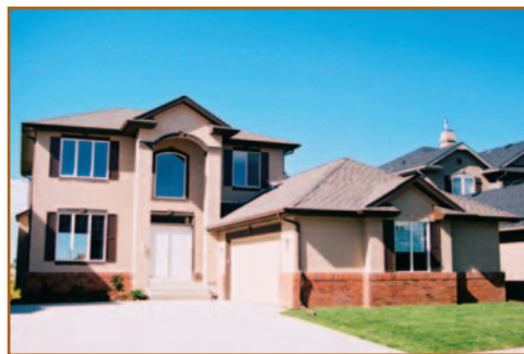
Springborough $675,000 102 Springborough Green, SW

The very best location in Spring Haven, backing onto and with gorgeous views of the natural treed green! The 2447' 2 stry has a fully dev'd walkout bsmt and a beautifully landscaped 56' x 117' lot w/ south backyard. Features open string curved stairway w/ hardwood treads, vaulted Liv Rm, formal Din Rm, island kitch, main fir den, 3+2 BR, walkout w/ Billiards/Fam Rm, triple garage.