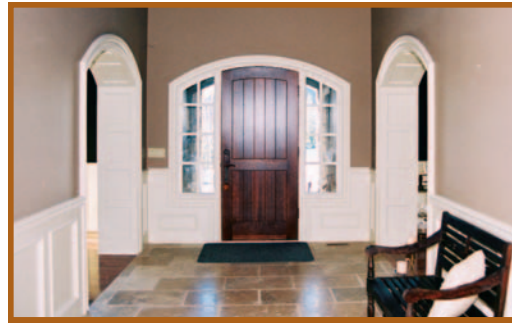
Elbow Valley $1,090,000 283 Snowberry Circle

Spectacular tudor style 2 storey offering over 4400 s.f. of living space plus fully developed basement for a total of almost 5800 s.f. of elegant living space. Impressive circular foyer with sweeping open staircase & turret ceiling, formal Living rm & dining rm w/ coffered ceiling, hardwood flrs, fabulous kitchen w/ 9' long island, semi-circular nook opening to large west backyard, 4 BR + den & 30' long bonus room (could be 2 more BR & bath).