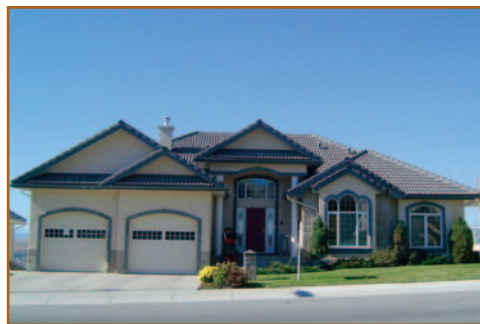
The Summit $750,000 3080 Signal Hill Drive, SW

Backing treed greenbelt, panoramic mountain views; This new home is in a beautiful setting to enjoy the fall colors and snow capped peaks! 2558+ dev'd walkout for a total of 3695' w/ hardwood floors/stairs, high ceilings, very open main floor w/ den, maple & granite kitchen, 3 upper Br incl. Master suite w/ sitting Rm, Walkout dev. offers 4th BR, den + games Rm.