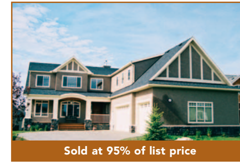
Elbow Valley $895,000 207 Winding River Point

Named "Best New Community in Canada 2004"! Wonderful 3631' 2 storey backing onto a greenbelt, like a show-home with high ceilings, cornice mouldings, ivory millwork, antiqued cabinetry, granite counters & vanities, maple floors, huge butler's pantry, den w/ built-ins, fabulous laundry & sewing room, Bonus Rm, vaulted Master Suite w/ fireplace shared w/ ensuite, 2 more BR w/ Jack & Jill ensuite.