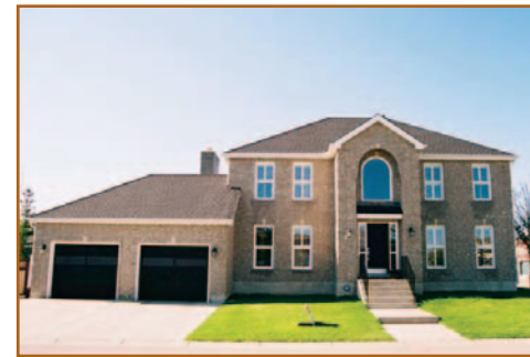
Christie Estates, $599,000 204 Christie Knoll Point, SW

Superb location, quiet street, fronting lovely wrought iron fenced park and backing greenbelt! This 2571' 2 stry is almost new & offers high ceilings, full main fir w/ heated limestone tiles, maple kitch w/ huge island & walk-thru pantry, vaulted flex Rm, 3 spacious upper BR incl master suite w/ views of Griffiths Woods Pk, lg bonus rm w/ high north/south windows, walkout w/ in-floor heat!