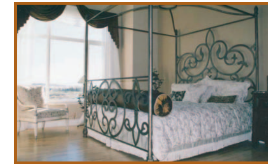
Lynx Ridge $875,000 106 Lynx Meadows Drive

Walkout bungalow with full wall of windows to enjoy the tranquil views into the south backyard, natural treed greenbelt & Griffiths Woods Environmental Reserve! This 1536 sq. ft. bungalow w/ developed walkout offers almost 2700' of development! Contemporary elegance w/ deep toned hardwood floors, clean lined built-ins & sleek Kitchen w/ granite countertops. 2 BR & den.