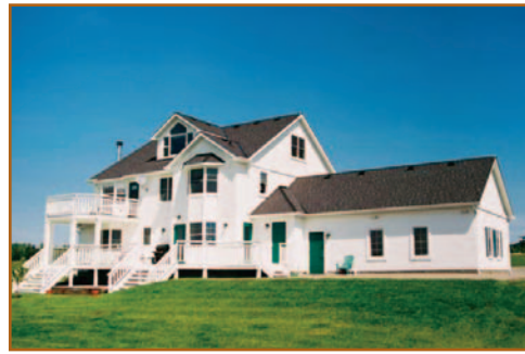
Springbank $719,000 24152 Range Road 31A

Embrace the natural beauty of the Calgary countryside. Acreage homes offer freedom, tranquility, magnificent scenery and mountain views. From a quarter acre to sweeping four acre lots; consider these beautifully appointed homes.