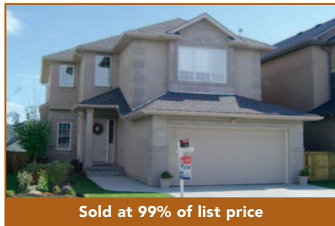
Sold at 99% of list price

w/ maple & iron spindles, vaulted Formal Liv Rm, formal dining room, island kitchen w/ walk-in pantry & stainless steel appls., boxed-out nook w/ French door to deck w/ Plexiglas deck, Fam Rm w/ soaring 2 stry height ceilings, 3 sided f/p & built-ins, 3 upper Br incl Mstr suite w/ sitting room to enjoy the views, dev'd walkout w/ Rec Rm, 5th BR & full bathroom.