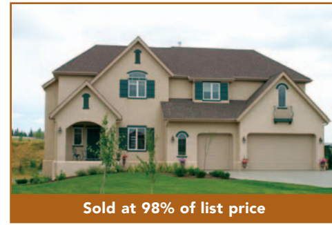
Elbow Valley $798,000 104 Whispering Woods Terrace

Incredible new home on a lovely, rolling 4 acre parcel backing east into the woods! This hillside bungalow offers 2471' on the main floor with an additional 1534' dev'd in the walkout basement. Open, plan, high ceilings, rustic arts & crafts style home w/ 10'-14' high ceilings, rich cherry cabinetry & flooring, granite counters and vanities, 2+2 BR & den, triple attached garage.