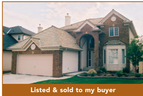
Listed & sold to my buyer

Bright & beautiful new home set on a pie lot w/ sunny south backyard & adjoining walking path! This home is walking distance to Westside Rec. Centre & a quick commute to downtown, offering 3 BR + huge upper bonus Room. Features Brazilian Cherry hardwood flooring, granite counters, maple cabinetry (some with glass fronts) & built-ins, 2406 s.f., undeveloped basement with large windows.