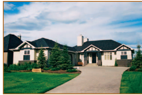
Elbow Valley, $749,000 3 Golden Aspen Crest

3.88 Acres, just minutes from West Hills shopping & a quick commute to downtown, perfect for horse/nature lovers! A gorgeous fenced parcel w/ panoramic mountain views, 3650' 2 stry, built in 1998 but designed to reflect turn-of-the-century grandeur, 5 BR+Bonus Rm, neutral décor w/ rich hardwood floor, wainscoting, cornice mouldings, French doors, wonderful country sized kitchen.