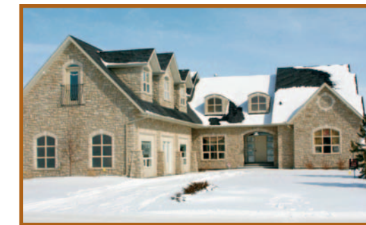
Heritage Pointe $1,250,000 20 Heritage Lake Boulevard

Superb location at the top of the hill in Spring Valley Estates with panoramic city, valley & mountain views! Although "new" this home exudes old world charm; the large foyer is open to the impressive maple & iron staircase with upper level "catwalk", the formal dining room has a coffered ceiling and the sitting room has 11' high ceilings. this 3530 s.f. 2 storey has a 4 car garage, partially developed walkout basement, air conditioning, in-floor heat in bathrooms & walkout, granite countertops & vanities, antiques maple & cherry cabinetry, 4 Bedrooms, den & bonus room.