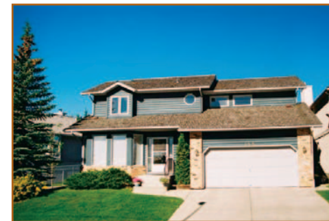
Strathcona Park $339,000 195 Strathaven Circle, SW

A wise investor said to "buy the lowest price home on the nicest street possible" and here's your chance! Surrounded by $500,000+ homes this 3 BR 2107' 2 stry has a lovely west yd w/ gorgeous (& expensive!) stone patio. Grand foyer w/ high ceilings, skylight, hardwood floor, formal DR w/ pillars, white kitchen w/ island & separate telephone desk/eating bar, wonderful mtn view from upper BR.