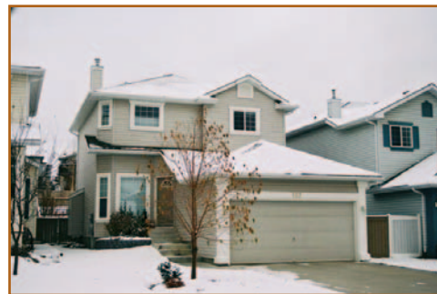
Richmond Hill $284,900 107 Sierra Nevada Close, SW

The biggest patio in the complex (15 x 22'!) This super-spacious 1151' property is a corner unit so has large windows with both south & west exposure, high ceilings, fireplace, laminate wood & plush carpet flooring, rich maple cabinetry, white millwork, 2 BR, 2 Baths (jet tub ensuite), kitchen with moveable island, lunch bar & top-of-the-line appliances. Includes in suite storage & laundry, heated parking.