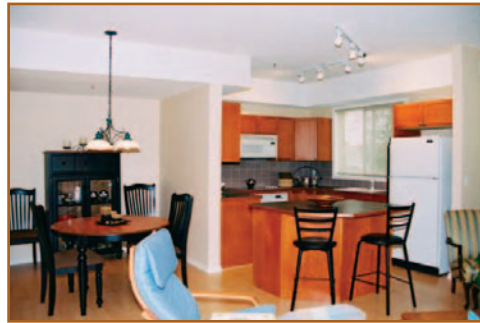
Patterson Lofts $169,900 #101, 6550 Old Banff Coach Rd, SW

The biggest patio in the complex (15 x 22'!) This super-spacious 1151' property is a corner unit so has large windows with both south & west exposure, high ceilings, fireplace, laminate wood & plush carpet flooring, rich maple cabinetry, white millwork, 2 BR, 2 Baths (jet tub ensuite), kitchen with moveable island, lunch bar & top-of-the-line appliances. Includes in suite storage & laundry, heated parking.