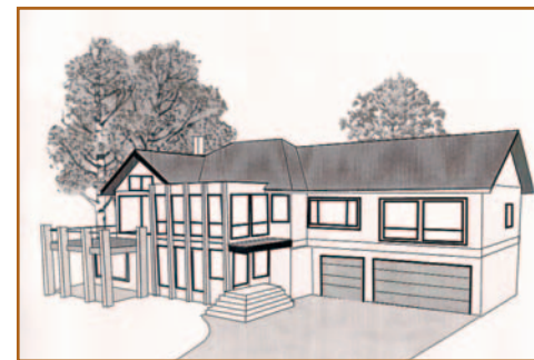
The Slopes, $995,000 86 Slopes Point

Superb location, city views & park-like setting both in back & front! This 3627' 2 stry (+ fully dev'd walkout) backs into the naturally treed ravine & fronts a large treed island. Such an elegant home with rich finishing, grand sweeping staircase with custom iron spindles, high ceilings, large formal rooms for entertaining, high windows to enjoy the views, 4+2 Br & den, incredible perennial gardens!