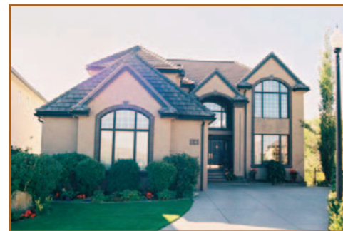
Patterson $849,900 14 Patterson Close, SW

Wow, you won't believe the breath-taking, panoramic views from both levels of this stunning walkout bungalow! Set high on the hill in "The Summit" on a huge lot (73' x 131') and offering 2354' on the main floor +1557' developed in the walkout & featuring high & coffered ceilings, etched glass, hardwood floors, extensive built-ins, curved stairway, media Rm, 3 BR + den.