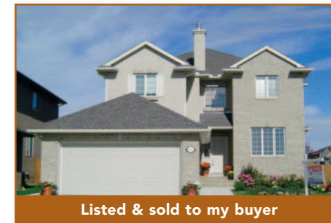
Strathcona $419,000 1581 Strathcona Drive, SW

Immediate Possession! Just steps to public & separate elementary schools in much sought after Strathcona Park, on a quiet crescent backing west onto a park! 2404' 2 storey with 4+1 BR, main floor den, hardwood thru most of main floor, vaulted Family Room, European kitchen w/ island & hardwood floor, formal LR & DR, basement developed w/ 2nd family room/billiard room, 5th BR & full bathroom.