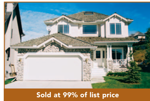
Sienna Park $329,000 27 Sienna Ridge Bay, SW

Bright & well kept 2 storey on cul-de-sac with nicely landscaped south backyard! This 1900' 2 st. offers 3 BR + large upper Bonus Rm w/ bay window. It's an open plan w/ Great Room w/ corner fireplace, formal Dining Rm, white island kitchen, extensive ceramic flooring, patio doors open to huge 2 tiered deck, easy care yard. Developed basement w/ Rec Rm, room for 2 more BR & lots of storage.