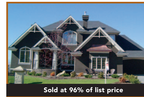
Sold at 96% of list price

You must see the spectacular Elbow River Valley & Rocky Mountain views from both levels of this new hillside bungalow! 2585 s.f. on the main floor + dev'd walkout basement for a total of 4400 s.f. with a total of 5 bedrooms, open plan main floor w/ den, great room, island kitchen, master BR w/ fireplace, lower games room & media room, huge 20' long front deck with Plexiglas surround, triple underdrive garage.