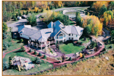
Bears paw $995,000 12 Woodland Rise

Almost 5500 s.f. of luxurious living space! This nearly new 2 storey offers over 4000' above grade + 1455' in the developed walkout basement (with a full kitchen and separate entryway ideal for nanny or mother-in-law). Finishing details include high ceilings, open string staircase ivory millwork, maple cabinetry & built-ins, 2 steam showers, 3 stone fireplaces, 4 BR, den & bonus room!