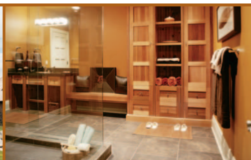
Stone Pine $2,750,000 43 Granite Ridge

New home in gated "Stone Pine". Spectacular walkout bungalow offering over 6000 square feet of total development, set on the ridge with panoramic City-to-Rocky Mountain views. Finishing details incl, beamed & hemlock ceilings, walnut paneling & built-ins, marble counters/vanities, mosaic, limestone, travertine & wal-