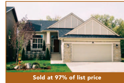
Sold at 97% of list price

Exquisitely upgraded Georgian style 2 storey w/ full brick exterior! 2675' + developed basement, 4+2 BR, sweeping curved stairway, high end California shutters, rich oak flooring, white kitchen w/ granite counters open to family room w/ brick f/p, beautiful formal sitting room & formal dining room with French doors, ivory millwork, cornice mouldings & designer paint colors!