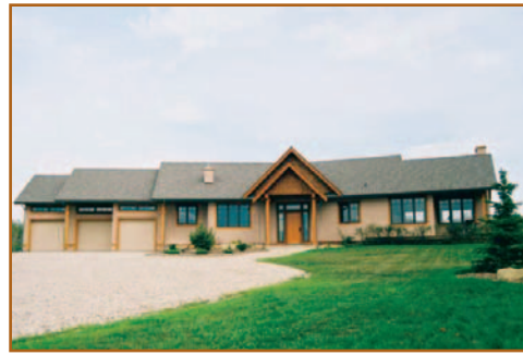
Bears paw $795,000 31189 Woodland Way

A charming country home! This 1985' bungalow has a fully developed walkout basement for a total of almost 4000' of living space + a triple attached garage! It's an open plan with a huge formal dining room, gable vaulted Great Rm w/ fireplace & large windows to enjoy the tranquil views over the greenbelt, master BR w/ clawfoot tub in ensuite + 2nd BR w/ full ensuite, 2 more BR down.