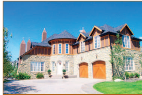
Elbow Valley, $995,000 23 Snowberry Gate

Incredible 4.5 acre lot with fantastic landscaping featuring ponds, waterfall, extensive patios, camp-fire area, children's playground, mature trees, barn & fenced livestock pens! Huge ranch style home offering 3836 s.f., up + fully developed walkout for a total of almost 7000 s.f. of living space w/ 7 BR + loft/office with high ceilings & windows, master suite w/ private deck & hot tub, oversized triple garage.