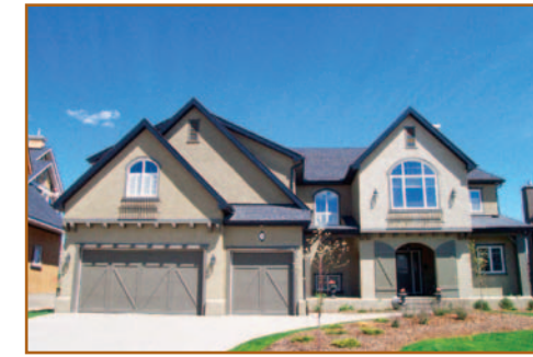
Elbow Valley $889,000 319 Snowberry Place

3123 sq. ft. 2 storey with triple attached garage and walkout basement! This stunning Elbow Valley home is just a short walk to the lake and playgrounds and offers high & vaulted ceilings, cornice mouldings, ivory millwork, open staircase w/ custom iron spindles, antiqued maple kitchen with granite counters, 3 BR + den, bathrooms with granite vanities, charming, a touch of Tuscany!