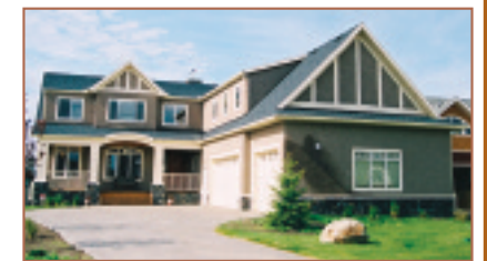
207 Winding River Point $895,000 ELBOW VALLEY, SIZE "L"

Fabulous open planned hillside bungalow on a 1/2 acre lot with panoramic Rocky mountain views from both main & walkout level! This 2241 sf home offers over 4000' of high end development with 9 & 11 foot high ceilings, cornice mouldings, rich cherry cabinetry & bookcases, granite counters & vanities, extensive hardwood & heated slate & limestone flooring and huge windows to enjoy the views. Include 2 Br on main + fully dev'd walkout includes extensive built-ins in games room, family room, huge spa-like bathroom, home office.