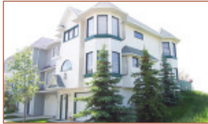
88 Prominence View SW $209,900 BACKING & SIDING RAVINE

Excellent opportunity to live up and rent down – have someone else help pay your mortgage! Perfect revenue and holding property, this 776 sq. ft. hillside bungalow has a 1 bedroom suite downstairs and is set on a 50 x 125 foot lot with off street parking. Efficient use of space with no waste, 2 bedrooms up with living room & eat in kitchen, hardwood flooring, lots of natural light, 1 bedroom suite down with good sized living/kitchen area, shared laundry. On the bike path to downtown and close to transit!