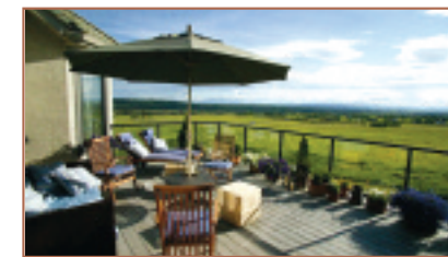
29 Slopes Road SW $849,000 WALKOUT BUNG., SUPERB VIEWS

Close-in acreage, as pretty a piece as you've ever seen, beautifully landscaped & fenced almost 4 acre parcel w/ 3650 sq. ft. 21/2 storey home, built in 1998, offering turn-of-the-century grandeur and welcoming country kitchen ambience! Finishing details include old fashioned sash windows, hardwood floors, cornice mouldings, extensive woodwork & wainscoting, fireplace mantles, hand plastered ceilings, off-white country kitchen & formal dining room w/ double French doors, 4 upper bedrooms (master w/ fireplace & huge private deck), fully finished 3rd floor w/ 5th bedroom and bathroom.