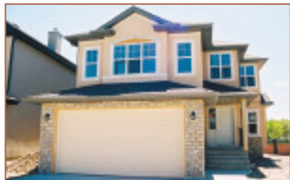
157 Springborough Green SW $459,000 SPRINGBOROUGH, NEW HOME

Perfect for a large family, extended or blended family! This 4019 sq. ft. 2 storey has a fully finished walkout basement (for a total of over 5500 s.f.) with a separate entry and full sized gourmet kitchen, family room w/ full wall of built-ins & fireplace, bedroom, den & luxurious bathroom which makes an ideal nanny, teen or granny suite! This home offers 3 upper bedrooms & huge bonus room (4th BR?) in a separate wing. It's a great room plan w/ high ceilings, open string staircase w/ iron railings, maple kitchen w/ slate countertops, 3 stone fireplaces.