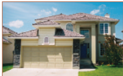
144 Sierra Madre Cres. SW $329,000 RICHMOND HILL ON GREENBELT

Unobstructed view property! Terrific location. This 3530 sq.ft. 2 storey offers panoramic mountain & city views from both main & upper floors, has a developed walkout basement & a 4 car attached garage! Grand open design with high ceilings, large great room w/ 11' high ceilings, sweeping iron & maple staircase, extensive hardwood floors, huge windows, gourmet kitchen w/ antiqued maple cabinetry, granite counters & centre island, formal dining room, sitting room, den with stone fireplace, 3 upper bedrooms & bonus room.