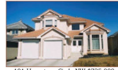
101 Hamptons Circle NW $735,000 GOLF COURSE, PANORAMIC VIEWS

Exceptional shaker style new home set on a 2 acre lot, backing into the trees, in Bearspaw. This thoughtfully designed family home offers 4247 sq. ft. of total development including walkout basement with a total of 5 bedrooms and 2 dens. Features a large kitchen w/ white cabinets & granite counters, huge walk-in butler's pantry, hardwood floors & nook w/ wrap around windows, formal dining room w/ stepped ceiling, living room w/ 2 storey height ceilings, granite faced fireplace & tranquil view of the woods. Triple attached garage.