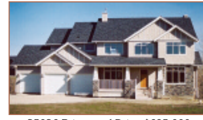
25036 Briarwood Drive $695,000 BEARSPAW, 2 ACRE PARCEL

Like new! Well designed & richly appointed bi-level style attached home with lower level walkout basement. Excellent location, quiet crescent with large single family homes and siding onto a greenbelt with walking pathway system. Finishing details incl. vaulted ceilings, skylights, richly stained oak millwork, hardwood flooring, cornice mouldings, raised panel doors, oak built-ins, double sided gas fireplace, den with double French doors & built-ins, white island kitchen, 2 BR & 2 full baths, designer window coverings. Ready now, nothing to do but move in!