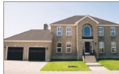
204 Christie Knoll Point SW $650,000 CHRISTIE ESTATES, RENOVATED

Backing into the wooded greenbelt adjacent to Griffiths Woods Environmental Reserve! This stylish hillside bungalow offers a fully developed walkout basement with a total of over 2700 sq. ft. of contemporary living space. Like the centre spread in a home & garden Magazine, this property shows beautifully. Features 10' high ceilings, floor to ceiling windows to bring the outdoors inside, smooth stone & berber carpeted floors, sleek maple cabinetry, granite countertops, ceramic tile vanity tops and stainless steel appliances.