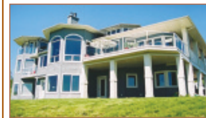
160th Street West $975,000 CALGARY 8.3 ACRES

Nothing to do but move in! Located in desirable Christie Estates on a quiet street this 2675 sq. ft. two storey has been extensively renovated in the past 5 years. It's a charming home with traditional centre hall plan and spacious formal rooms. Upgrades include oak hardwood flooring, granite kitchen counters, cornice mouldings, designer paint colors and wide California shutters. Grand foyer w/ sweeping curved staircase, formal living & dining rooms, island kitchen, adjoining family room with brick fireplace and 4 large upper floor bedrooms.