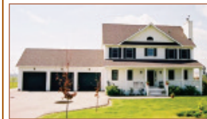
Spring Haven Estates $739,000 SPRINGBANK 3.88 ACRES

View interior photos at www.samluxuryhomes.com