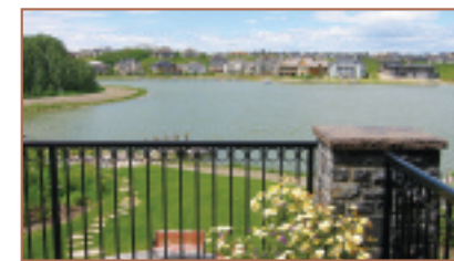
Elbow Valley $1,190,000 LAKEFRONT BUNGALOW

Spectacular home, high on the hill, with panoramic, unobstructed Rocky Mountain views from both levels! This hillside bungalow offers a total of almost 6700 sq. ft. of living space and was completed in 1998. finishing details include a mix of 9' to 20' high ceilings, grand open "split" staircase w/ iron spindles, hardwood floors, white millwork, natural wood cabinetry, granite counters, river-rock fireplaces, built-ins, a total of 4 bedrooms (all w/ ensuite), master w/ 2nd floor observatory/artist's retreat, huge media room and triple attached garage.