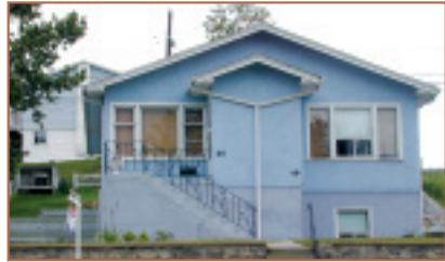
48 Mission Road SW $209,900 LIVE UP, RENT DOWN!

Excellent opportunity to live up and rent down – have someone else help pay your mortgage! Perfect revenue and holding property, this 776 sq. ft. hillside bungalow has a 1 bedroom suite downstairs and is set on a 50 x 125 foot lot with off street parking. Efficient use of space with no waste, 2 bedrooms up with living room & eat in kitchen, hardwood flooring, lots of natural light, 1 bedroom suite down with good sized living/kitchen area, shared laundry. On the bike path to downtown and close to transit!