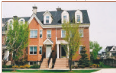
406 Garrison Square SW $379,000 SUITE FOR COLLEGE STUDENT?

The Estates of Richmond Hill, terrific location, on a quiet crescent backing west onto a greenbelt with walking pathway. This 2092 sq. ft. 2 storey also has a finished basement offering an additional 585 s.f. of living space for a total of almost 2700 s.f.! It's a great room plan w/ formal dining room, large kitchen w/ centre island/eating bar, dining nook opening to deck, den with French door, upper loft overlooking foyer, huge master w/ jet tub ensuite, 2 additional BR + basement w/ games room & adjoining den/bedroom & full bathroom.