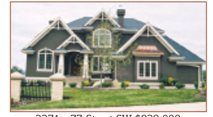
3371 - 77 Street SW $829,000 SPRING VALLEY ESTATES, NEW

Beautifully designed, gently used, one owner home in desirable "Hamptons" backing onto the golf course and ravine with panoramic city & countryside views from all 3 levels! 3511 sq. ft. 2 storey + fully developed walkout basement & triple attached garage, finishing details include ivory millwork, plush carpeting, antiqued cabinetry, granite countertops, maple built-ins, open string curved stairway, main floor den, huge gourmet kitchen, a total of 5 bedrooms (3 w/ full ensuite bathrooms) and master suite with 2 walk-in closets, huge bow window to enjoy views.