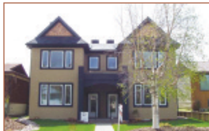
2017-31 Avenue SW $449,000 MARDA LOOP NEW INFILLS

Incredible location, backing beautiful greenbelt with 2 ponds! Exceptional Laratta-built cape cod style 2 storey with walkout basement, 2812 sq.ft. w/ 4 upper BR, main floor den with beautifully crafted built-in desk & bookcases, formal dining rm w/ French doors, richly stained maple kitchen w/ stone countertops, large Great Rm. Finishing details incl. slate & maple flooring, high & barrel vaulted ceilings, open iron & maple staircase, arched windows, furniture quality built-ins, large semi-covered deck. Most rooms with unobstructed view. This home is sure to impress, best price in the area!