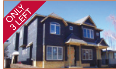
529-34 Street NW $319,900 NEW PARKDALE TOWNHOMES

Like new! Well designed & richly appointed bi-level style attached home with lower level walkout basement. Excellent location, quiet crescent with large single family homes and siding onto a greenbelt with walking pathway system. Finishing details incl. vaulted ceilings, skylights, richly stained oak millwork, hardwood flooring, cornice mouldings, raised panel doors, oak built-ins, double sided gas fireplace, den with double French doors & built-ins, white island kitchen, 2 BR & 2 full baths, designer window coverings. Ready now, nothing to do but move in!