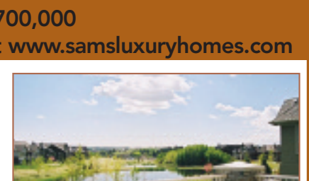
20 Snowberry Gate $795,000 BACKING ONTO PONDS

Beautifully designed, gently used, one owner home in desirable "Hamptons" backing onto the golf course and ravine with panoramic city & countryside views from all 3 levels!† 3511 sq. ft. 2 storey + fully developed walkout basement & triple attached garage, finishing details include ivory millwork, plush carpeting, antiqued cabinetry, granite countertops, maple built-ins, open string curved stairway, main floor den, huge gourmet kitchen, a total of 5 bedrooms (3 w/ full ensuite bathrooms) and master suite with 2 walk-in closets, huge bow window to enjoy views.