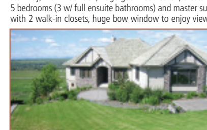
29 Slopes Road SW $849,000 WALKOUT BUNG., SUPERB VIEWS

Never lived in, former showhome, just minutes from Crowfoot shopping mall and both backing and siding onto the golf course at Lynx Ridge. Exquisitely appointed bungalow with fully developed walkout basement, 2498 sf on main, 2+3 BRs + main floor den, extensive maple flooring, high ceilings, French doors, classic columns, dream kitchen with granite countertops, walkout development includes media room, billiards room w/ wet bar & 3 BRs. Includes it's own private outdoor sports court ideal for tennis or basketball, triple garage.