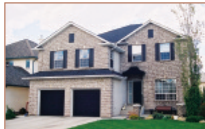
7 Strathridge Gardens, SW $449,000 STRATHCONA BEAUTIFUL BACKYARD

2 available, new 2 storey attached executive homes nearing completion in South Calgary just 2 blocks from trendy Marda Loop shops & restaurants. 1976 sq.ft. w/ 9' ceilings, soft-line drywall corners, ivory millwork, deep maple cabinetry, granite countertops & vanities, 2 gas fireplaces (1 in the master BR) 2 upper BR both w/ full ensuites & walk-in closets, 2nd floor laundry, comes w/ double garage, landscaped & fenced south backyard.