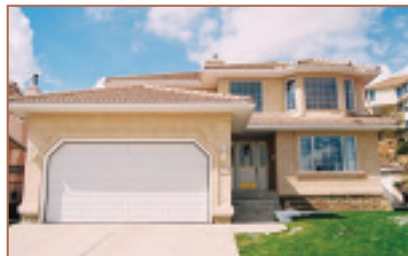
23 Signature Mews SW $ 369,000 SIGNATURE PK WALK TO SHOPPING

Prominence Point, exclusive cul-de-sac, executive 2 storey, 3200 sq. ft. + fully developed walkout basement offering almost 4500 feet of custom designed living space. Features high ceilings with numerous skylights, 4 fireplaces, granite and ceramic flooring, granite counters, white cabinets, curved stairway, 4+1 bedroom + den and loft. Walkout developed with enclosed spa with hot tub, rec room and games room with wet bar. Triple garage. Wonderful location backing park, fronting treed island, and with downtown views.