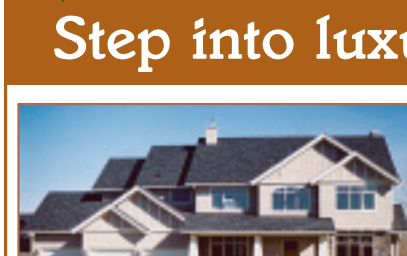
25036 Briarwood Drive, $695,000 BEARSPAW, 2 ACRE PARCEL

Signal Hill. Renovated 3 bedroom 2 storey with upper bonus room and fully developed walkout basement.† Set on the ridge with panoramic views to downtown this spacious 2677 sq ft. home offers a total of over 3700 sq. ft. of living space.† Upgrades include hardwood flooring throughout main floor, up to and including bonus room, newer carpeting, countertops, appliances, 2 gas fireplace inserts, air conditioning, blinds, Plexiglas deck surround and more. Walkout development includes rec room w/ granite faced f/p, wet bar, den or 4th BR & full bath.