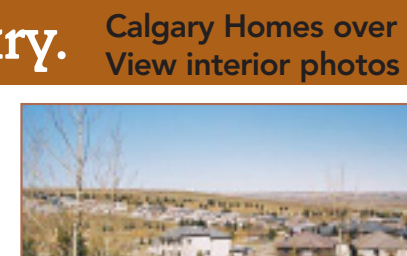
101 Hamptons Circle NW $769,000 GOLF COURSE, PANORAMIC VIEWS

Exceptional shaker style new home set on a 2 acre lot, backing into the trees, in Bearspaw. This thoughtfully designed family home offers 4247 sq. ft. of total development including walkout basement with a total of 5 bedrooms and 2 dens. Features a large kitchen w/ white cabinets & granite counters, huge walk-in butler's pantry, hardwood floors & nook w/ wrap around windows, formal dining room w/ stepped ceiling, living room w/ 2 storey height ceilings, granite faced fireplace & tranquil view of the woods. Triple attached garage.