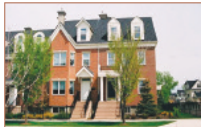
406 Garrison Square SW, $379,000 SUITE FOR COLLEGE STUDENT?

Quiet cul-de-sac in established neighborhood, walking distance to Sunterra market and trendy boutiques. 2265 sq.ft. + fully dev'd basement. Offers 3 upper Br + 1 on main floor adjacent to 3 pc bathroom. In immaculate condition w/ trackless carpeting, neutral colors, white kitchen, main floor family room + large formal living & dining rms, tiered pie lot w/ sunny west exposure. Bsmt w/ sauna, gas f/p and wet bar.