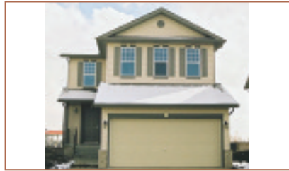
52 Cougarstone Square SW, $269,000 COUGAR RIDGE WALK TO SCHOOL

On quiet street w/ a short walk to schools. Features very open main floor layout offering living room with clean-burning gas fireplace and durable Berber carpeting, lg dining nook with patio doors to southeast backyard, kitchen w/ walk-thru pantry, plus bath and laundry area on main. Upper floor features loft-style bonus room with patio doors to southeast balcony, master with walk-in closet and ensuite w/ jetted tub, 2 additional bedrooms, and 4-piece bath. Fast possession offered.