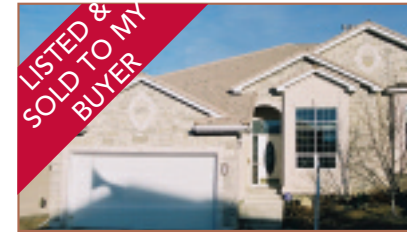
4536 Hamptons Way NW $449,000 BACKING THE GOLF COURSE

Super location, close to river, U of C, and the new Children's Hospital! Classic Georgian style 2 storey townhomes built by prominent upscale developer. Average size is 1327 sq. ft. with option for fully developed basement. Features 9 foot ceilings, gas fireplace, 2 bedrooms, 2 baths, custom upscale finishings incl. hardwood flr, granite counters, maple cabinets, stainless steel appliances, designer mouldings & built-ins. Landscaped yards & single garage. Ready for occupancy this spring, still time to choose your colors and the unit of your choice if you call immediately!