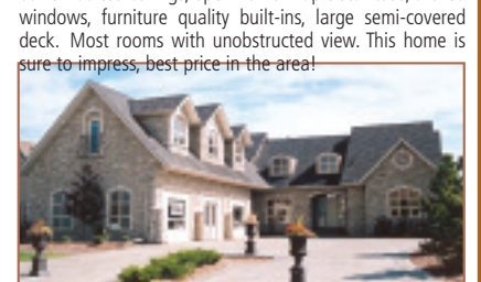
20 Heritage Lake Blvd. $1,250,000 ON THE LAKE AT HERITAGE PT.

Fabulous open planned hillside bungalow on a 1/2 acre lot with panoramic Rocky mountain views from both main & walkout level! This 2241 sf home offers over 4000' of high end development with 9 & 11 foot high ceilings, cornice mouldings, rich cherry cabinetry & bookcases, granite counters & vanities, extensive hardwood & heated slate & limestone flooring and huge windows to enjoy the views. Include 2 Br on main + fully dev'd walkout includes extensive built-ins in games room, family room, huge spa-like bathroom, home office.