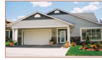
28 Patterson Rise, SW $525,000 STUNNING,RENO'D BUNGALOW

Stunning executive attached home in an ideal location backing onto the golf course & with lake and fountains view. Immaculately kept, like new, walkout bungalow with 12' ceilings, cornice mouldings, white millwork, 8' raised panel doors, rich maple cabinetry, granite countertops in kitchen & bathrooms, stepped ceiling, skylight, open curved staircase, maple flooring, exquisite light fixtures, furniture quality built-ins, huge windows and top of the line appliances. Offers 1660' on the main + 985' in the walkout, 1 bedroom & den up, 2nd bedroom, billiards room & rec room down. Very elegant finishing throughout with tranquil lake views from living room, kitchen, Master bedroom & walkout.