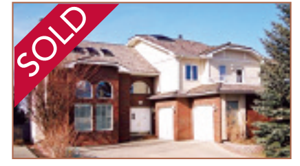
32 Patterson Mews SW $599,000 BACKING PARK, CITY VIEWS

Redesigned and totally renovated in the past 3 years! This 2200 sq. ft. bi-level includes a fully developed walkout basement, city views and 4 car attached garage. Features extensive dark hardwood and slate flooring with in-floor heat, incredible rich maple kitchen w/ granite covered centre island and adjoining butler's pantry with extra cabinetry & 2nd dishwasher, 2 BR on main incl. master w/ gas fireplace & 5 piece ensuite w/ heated flooring, beautifully developed walkout w/ 2 more BR, home office, family room and mirrored workout area.