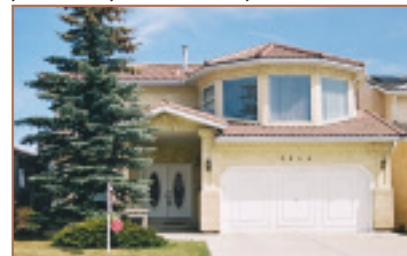
2856 Signal Hill Drive, $395,000 PANORAMIC VIEWS, DEVELOPED WALKOUT

Ideally located in trendy Garrison Woods, and minutes from Mount Royal College. This 3 level 2022 sq.ft. home has an additional 600sq.ft. walkout basement w/ kitchen area, rec room, BR & theater ensuite bath w/ jetted tub & laundry. 9ft ceilings on upper levels, hardwood flooring in the dining & living rms, large kitchen w/ white cabinets. 2 bedrooms, loft, and master w/ ensuite. Third level features an open plan studio with 11ft ceilings. Beautiful Brick exterior & double garage. Ready for immediate possession.