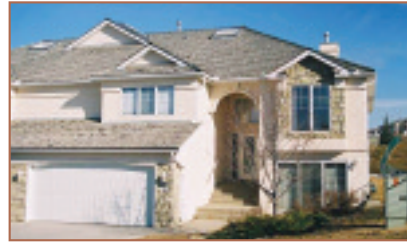
59 Scimitar View, NW $295,000 SCENIC ACRES WALKOUT VILLA

On quiet street w/ a short walk to schools. Features very open main floor layout offering living room with clean-burning gas fireplace and durable Berber carpeting, lg dining nook with patio doors to southeast backyard, kitchen w/ walk-thru pantry, plus bath and laundry area on main. Upper floor features loft-style bonus room with patio doors to southeast balcony, master with walk-in closet and ensuite w/ jetted tub, 2 additional bedrooms, and 4-piece bath. Fast possession offered.