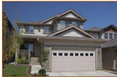
Springbank Hill $695,000 15 Springbank Mount, SW

Cul-de-sac location, generously sized 2-storey with developed basement, almost 3100 s.f. of living space, hardwood floors, maple kitchen, formal dining room, large bonus room, 3 bedrooms, basement developed with play/games room, den with French doors & 2 pc bath.