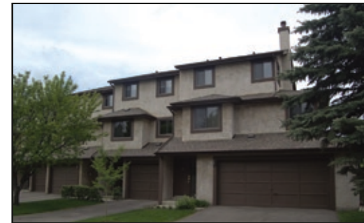
Glamorgan $399,000 44 Glamis Gardens, SW

Unique, upgraded 2 storey, travertine tile floors, stone raised bowl sinks throughout, kitchen with upgraded stainless steel appliances & honed slate counters, vaulted master bedroom, ensuite with jet tub & waterfall faucet, 3 bedrooms & den.