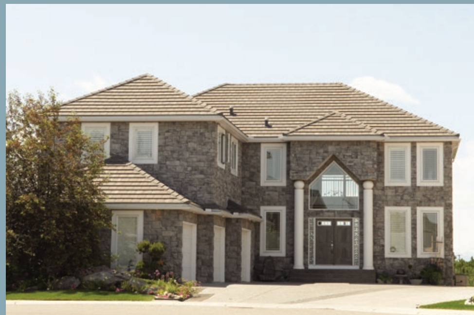
Contemporary showpiece in Spring Haven $1,995,000 63 Strathridge Gardens, SW

Backing onto the ravine on one of the most desirable streets on the West side of Calgary! This sleek and contemporary executive residence offers 3700 s.f. of living space + fully developed walkout basement for a total of almost 5400 of luxury with 3 + 1 bedrooms & upper den (could be guest room or bedroom), walkout developed with large games room, family room, exercise room, wine cellar, bedroom & bath. Features lovely, heated porcelain tile floors, motorized Hunter-Douglas blinds (+ California shutters), European