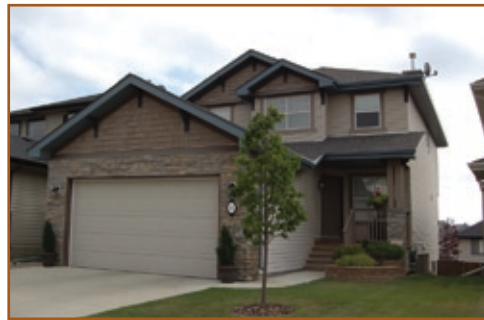
Springbank Hill $675,000 14 Springbluff Boulevard, SW

Stylish 2 storey with developed walkout basement, open plan, island kitchen, hardwood & travertine tile floors, 3 bedrooms + den, walkout with family/media room with entertainment centre, wet bar, & 4th bedroom, total of almost 3000 s.f. of chic living space!