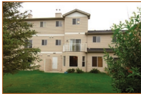
West Springs $419,000 12 West Cedar Rise

Wonderful opportunity to own newer 3 bedroom home with 1800+ s.f. of living space in West Springs! 2 car garage, patio + 2 balconies, deluxe kitchen with stainless steel appliances, granite counters & hardwood floors. Low condo fees.