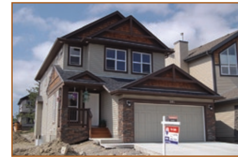
Montreaux $649,000 191 St Moritz Drive, SW

Beautiful new Montreaux home, almost 2000 s.f. + developed basement, open plan, island kitchen with deep toned maple cabinets, hardwood floors, great room with fireplace, 3 bedrooms & den, basement developed with 4th bedroom, bath & family room.