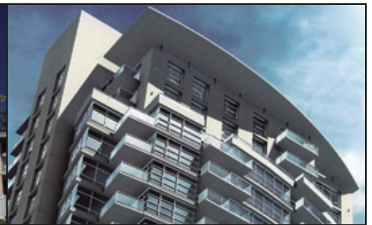
Spruce Cliff $399,900 55 Spruce Place, SW

2 incredible new condo suites, both with double indoor parking, $399,000 and $459,000, choose your view, either overlooking the golf course & city lights or west to the Rockies, 2 bedroom/2 bath, terrific amenities including gym, pool, hot-tub.