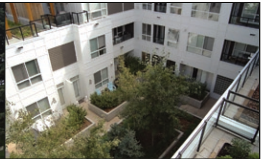
Bridgeland $609,000 Penthouse, 830 Centre Ave, NE

Spectacular 1400 s.f. penthouse suite, panoramic views of downtown & river valley, huge windows with motorized blinds, high ceilings, open concept, contemporary flair, concrete counters & sinks, hardwood floor, 3 bedrooms/2 baths, multiple balconies!