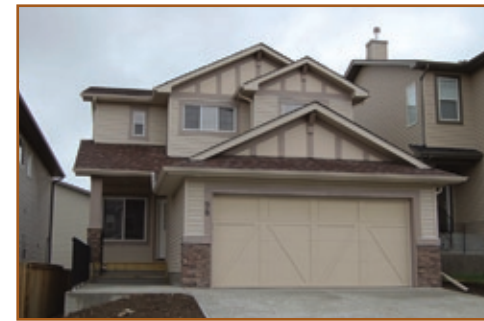
Montreaux $649,000 98 St Moritz Terrace, SW

Gorgeous 3 bedroom home with gleaming hardwood floors on 2 floors, furniture-quality closet organizers in all bedrooms, unique stone details including a stone feature wall, granite counters, stainless steel appliances & stone backsplash.