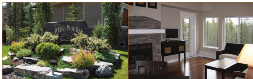
Discovery Ridge $419,900 #519, 20 Discovery Ridge Close, SW

Top floor suite in the fabulous "Wedgewoods", a spectacular Canmore style setting, nestled into Griffiths Woods Park. 1100 s.f. 2 bedroom/2 bath condo with African Mahogany & Italian tile floor, high-end appliances in maple kitchen (incl. convection range with warming oven),