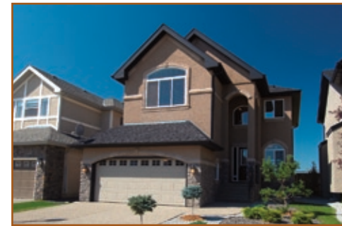
Wentworth $750,000 80 Wentworth Crescent, SW

A rare find in the area, bungalow with loft + developed basement for a total of 3750 s.f. of luxurious living space, main floor master suite + 2 more bedrooms upstairs & 4th down (with ensuite), soaring ceilings, built-ins, kitchen with granite counters.