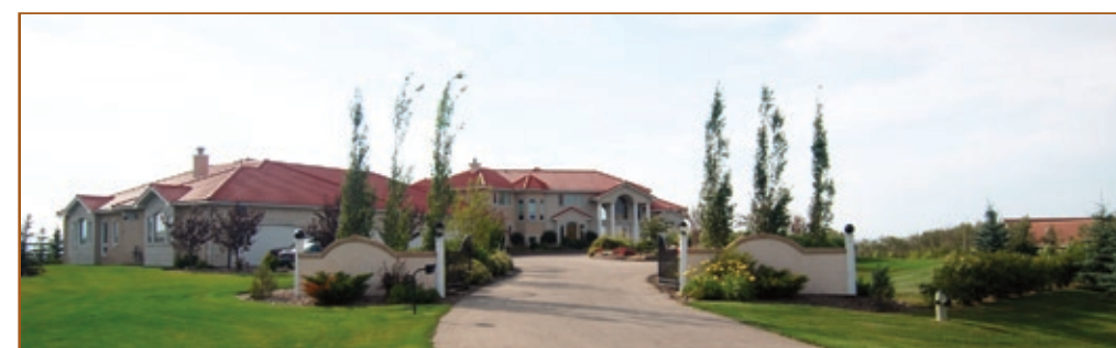
Springbank $3,200,000 67 Artist View Point

Awe-inspiring panoramic views of the mountains & river valley are yours to enjoy in this spectacular home in a picturesque location. 2 acre parcel with beautiful grounds showcasing ponds, streams, a waterfall feature and firepit! Over 7100 s.f. above