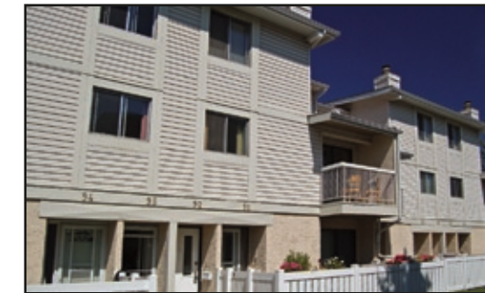
Glenbrook $289,000 #92, 3015 - 51 Street, SW

Exceptional renovation, this one has been entirely re-invented, 1161 s.f. 2-storey with 2 bedrooms, brazilian cherry hardwood & designer carpet flooring, jetted tub, spacious living room & dining room, south exposure, close to downtown, shopping & transit.