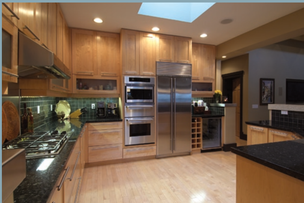
Aspen Estates $1,895,000 159 Aspen Meadows Place, SW

Beautiful Frank Lloyd Wright inspired architecture- This spectacular walkout bungalow is tucked away on an exclusive cul-de-sac on a large lot (70 x 140-ft). Offering 2977 s.f. on main floor + developed walkout, for a total of over 5700 s.f. of living space & 3 bedrooms in total, the dramatic, open plan is perfect for entertaining, with spectacular upgrades, soaring ceilings, rich finishings, extensive use of natural stone, soaring ceilings with celestary windows, dual staircases