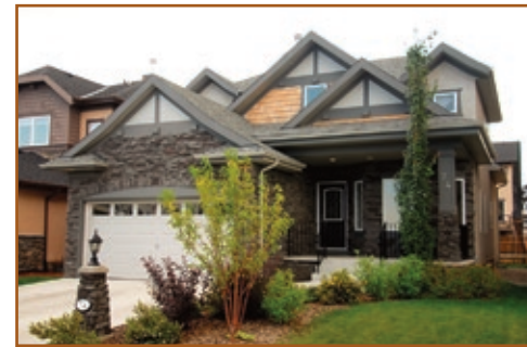
Cougar Ridge $750,000 74 Cougar Plateau Circle, SW

A rare find in the area, bungalow with loft + developed basement for a total of 3750 s.f. of luxurious living space, main floor master suite + 2 more bedrooms upstairs & 4th down (with ensuite), soaring ceilings, built-ins, kitchen with granite counters.