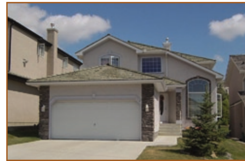
Sienna Park $748,000 418 Sienna Heights Hill, SW

Great Location, backing greenbelt, steps to school, skating rink & parks! 2259 s.f. 2-st + developed basement, formal living room & dining room + main floor family room & den, curved staircase, 3 + bedrooms, master with sitting room, beautiful, newly developed basement.