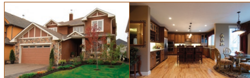
Discovery Ridge $995,000 418 Discovery Ridge Boulevard, SW

Large executive home, with fully developed basement, approximately 4000 s.f. of luxurious living space. Highlighted by a huge kitchen with granite counters & impressive walk-thru pantry w/ 2nd fridge and extensive built-ins, open plan living & dining with gleaming hardwood, beautiful built-ins and