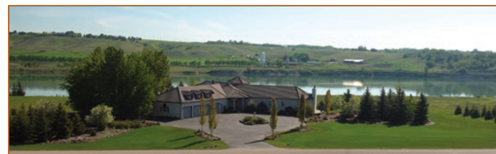
Water-front $2,500,000 142 Emerald Bay Drive

Rare waterfront property just 25 minutes to downtown Calgary! Perfect for boat lovers, enjoy water-skiing this summer & ice fishing in the winter. 2.35 acres directly onto the Bears paw reservoir, with pastoral views of water & farms, spectacular 3700 s.f.