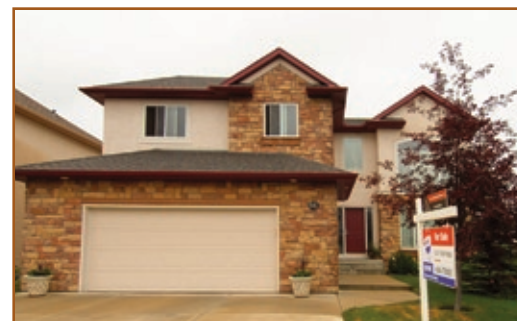
Strathcona $995,000 66 Strathridge Grove, SW

Superb location, backing the ravine in desirable Spring Haven, one of the most popular neighborhoods on the west side! 2500 s.f. 2-storey, neutral décor, just freshly painted in designer colors, vaulted ceilings, hardwood floors, gracefully curving stairway, 4 + 1 bedrooms (master with huge walk-in closet),