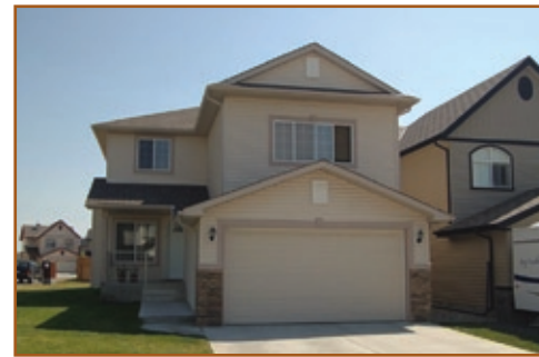
West Springs $525,000 107 Weston Manor, SW

Stylish newer home, across from green space & just a few steps to the Waldorf School! Approx 1800 s.f. + superb basement development with media room, 3 bedrooms + bonus room, open plan, beautifully landscaped backyard, this one is a 10!