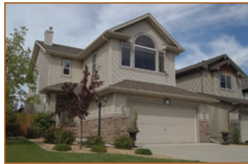
Cougar Ridge $519,000 552 Cougar Ridge Drive, SW

Stylish newer home, across from green space & just a few steps to the Waldorf School! Approx 1800 s.f. + superb basement development with media room, 3 bedrooms + bonus room, open plan, beautifully landscaped backyard, this one is a 10!