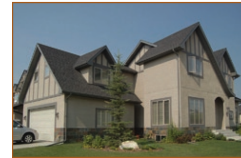
Discovery Ridge $849,000 1 Discovery Ridge Link, SW

Unique, upgraded 2 storey, travertine tile floors, stone raised bowl sinks throughout, kitchen with upgraded stainless steel appliances & honed slate counters, vaulted master bedroom, ensuite with jet tub & waterfall faucet, 3 bedrooms & den.