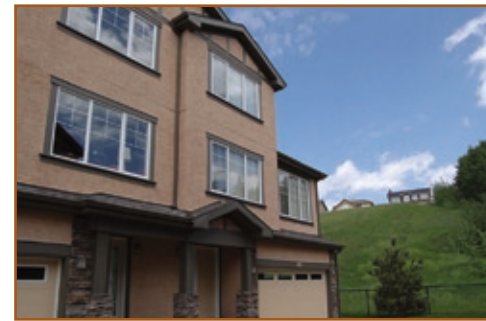
Discovery $559,000 #302, 10 Discovery Ridge Hill, SW

Stylish, spacious townhouse, double garage, 1700+ s.f. of luxurious living space, kit with granite counters, 3 bedrooms/3 baths, convenient location steps to coffee shop, wine & convenience stores, but siding onto tranquil greenbelt.