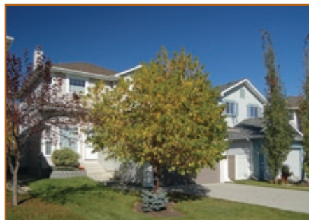
Richmond Hill $499,000 107 Sierra Nevada Close SW

1013 s.f. 2 bedroom, 2 bath condo in the sought after "5 West" building downtown! Bow River & downtown views, open plan with beautiful kitchen featuring granite & stainless appliances. Walk to work or the C-train, parks & restaurants just steps away!