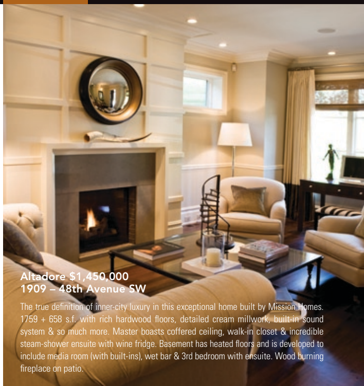
Altadore $1,450,000 1909 – 48th Avenue SW

The true definition of inner-city luxury in this exceptional home built by Mission Homes. 1759 + 658 s.f. with rich hardwood floors, detailed cream millwork, built-in sound system & so much more. Master boasts coffered ceiling, walk-in closet & incredible steam-shower ensuite with wine fridge. Basement has heated floors and is developed to include media room (with built-ins), wet bar & 3rd bedroom with ensuite. Wood burning fireplace on patio.