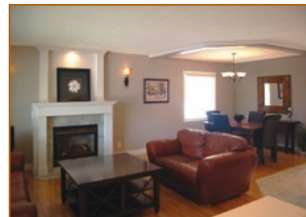
Lakeview $549,000 6428 Law Drive SW

Backing a linear park with walking paths! This 1664 + 449 s.f., 3 + 1 bedroom home boasts a fully developed basement, 9' ceilings, a bright den with bayed window, spacious great room with fireplace & fabulous open kitchen. A perfect family home!