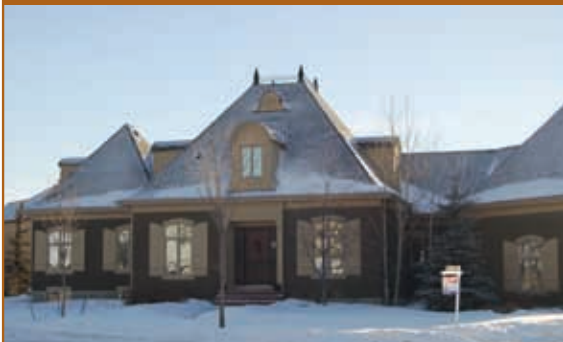
Discovery Ridge $950,000 • 2 Discovery Ridge Manor SW

French Country home backing a park! You'll love the main floor master suite, hickory hardwood, Douglas fir beams, site-built Walnut cabinets, granite counters & butler's pantry w/ wet bar & pro appliances. 2788 sq ft above grade + 568 sq ft developed down.