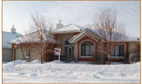
Signal Hill $950,000 • 3076 Signal Hill Drive SW

Enjoy unobstructed, breath-taking Rocky Mountain views from this large bungalow with developed walkout basement. Set on a large 72' x 134' ridge lot this 2400 sq ft executive home is dramatic & open with high & vaulted ceilings, 2 + 2 bedrooms, den & media room.