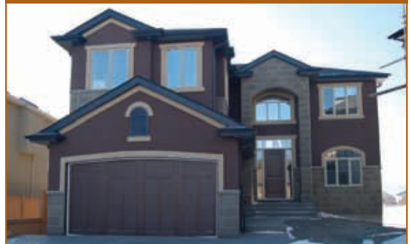
Rocky Ridge $1,060,000 • 121 Rockcliff Bay NW

Rocky Mountain views, backing a park! 3400 sq ft New home with walk-out basement in exclusive Rock Lake Estates. Set on a large pie-lot near the lake this dramatic 3 bedroom + den home boast furniture quality maple built-ins + fitted California-style closets throughout.