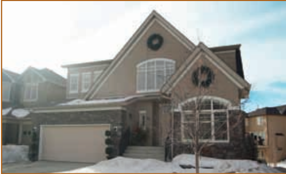
Discovery Ridge $899,000 • 84 Discovery Ridge SW

Executive home with serene views just steps to Griffiths Woods Park! 3717 sq ft of living space: 3 + 1 bedrooms, developed walkout, hardwood, California shutters & more. Kitchen with granite, stainless appliances & sun-soaked nook. Rec room, 4th bedroom & full bath in walkout.