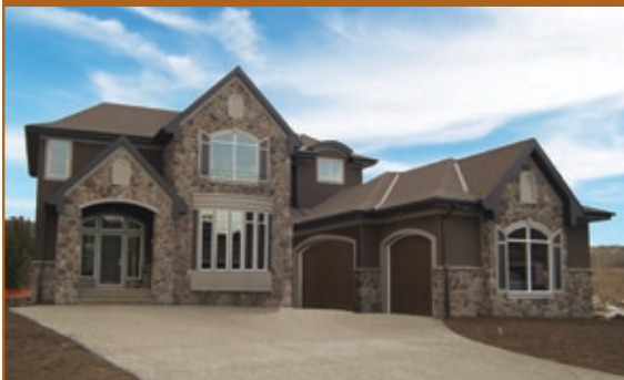
Mystic Ridge $1,695,000 • 30 Spirit Ridge Lane SW

3/5 of an acre lot backing a ravine! So much space and only 15 minutes from downtown. This luxurious 3 bedroom home boasts a West rear yard, mountain views, travertine floors, granite counters, pro series appliances & huge vaulted master with incredible 6 piece ensuite!