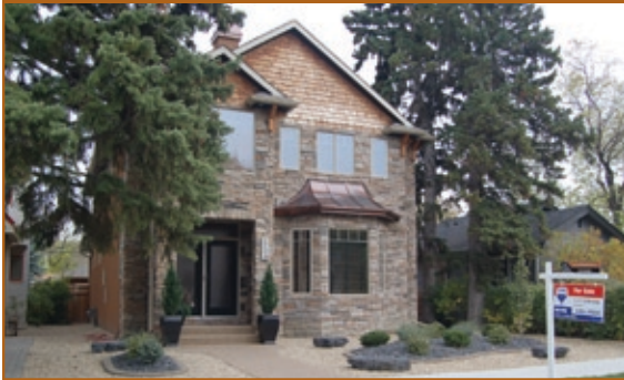
Inner City $1,395,000 • 1724 – 24A Street SW

Just a few minutes to downtown & situated on an extra wide 40' x 125' lot, this luxurious 2,541 sq ft 3 + 1 bedroom home boasts: Developed basement, 3 storey spiral staircase, 25' x 15' 2 tiered media room, and over-sized triple garage!