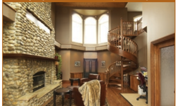
Springbank $2,995,000 • 53 Uplands Ridge

Perched on the ridge with fabulous Rocky Mountain views from nearly every room! 6,800+ sq ft of luxury, includes 3 bedrooms, a 2 level office featuring a 33 foot fieldstone fireplace. State of the art media room, home gym complete with shower & stunning wine cellar.