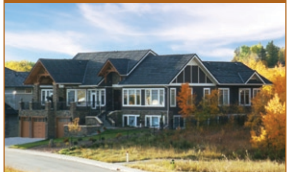
Fortress Rise $1,995,000 • 4 Fortress Rise SW

5472 sq ft of developed living space: 3 + 1 bedroom's, 4.5 baths, triple garage and daylight basement featuring a wet bar, home gym with steam shower & home theatre. Incredible master retreat with programmable jet steam shower & Kohler air-tub!