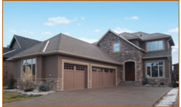
Aspen Meadows $1,599,000 • 31 Aspen Meadows Manor SW

Custom 4 + 1 bedroom luxury home boasting 4382 sq ft with developed walkout. Limestone floors, granite counters, California Closets, jetted steam shower & Ultra tub in Master. Oversized, heated, triple garage has been finished by Garage Utopia.