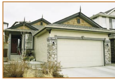
$389,000 Springbank Hill 1270 sq.ft. detached bungalow, professional landscaping