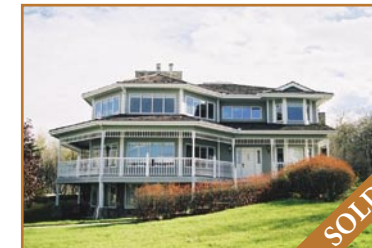
$1,390,000 Anatapi 4694 sq.ft. 2 storey, on 1 acre with views