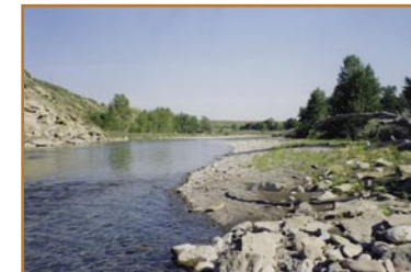
$1,370,000 65 Acres south of Calgary 1/2 mile on the Highwood River Rocky Mountain Views