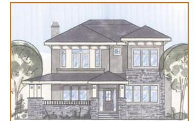
$1,400,000 Hounsfield Heights NW 2780 sq.ft. new home