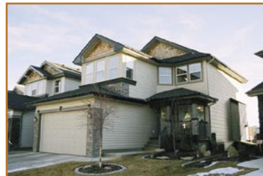
$495,000 Springbank Hill As new condition, professionally landscaped yard with trees and view