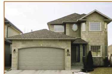
$525,000 Strathcona 3 bedroom 2-storey with fully finished basement and south backyard