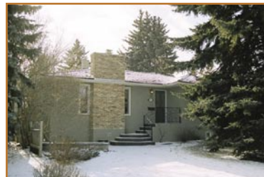
$625,000 Altadore 1622 sq. ft. renovated bungalow w/ huge Master bedroom addition, great location