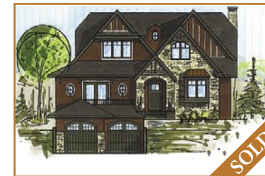
$1,600,000 Hounsfield Heights 3500 sq.ft. new home, sold to my own buyer