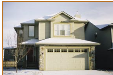
$495,000 Cougar Ridge 2240 sq.ft. upgraded Cidex-built home, walking distance to French school