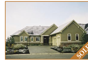
$1,100,000 Elbow Valley 2453 sq.ft. walkout bungalow, backing ravine