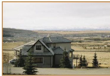
$299,000 The Slopes 1/3 acre vacant lot on cul-de-sac, mountain views