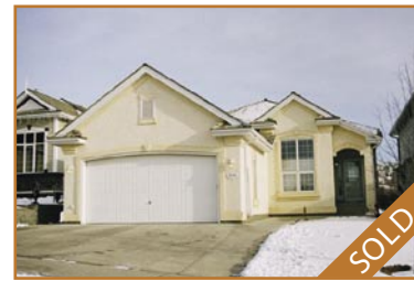
$450,000 Springbank Hill 1645 sq.ft. bungalow backing onto park