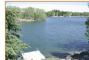
$1,695,000 Lake Bonavista Estates 3581 sq.ft. 2 storey, backing onto the lake