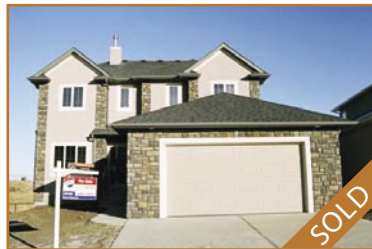
$595,000 Cougar Ridge 2614 sq.ft. new home, walkout basement, backing onto pond