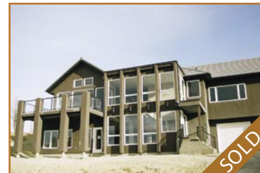
$995,000 The Slopes 2585 sq.ft. new home, spectacular mountain and valley views