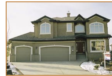
$1,095,000 Spring Valley Estates 3400 sq.ft. two storey with pie lot, mountain views & walkout basement