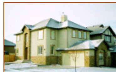
$585,000 Springborough 4 bedroom & den, developed basement, granite, cherry, slate, stone wine cellar SOLD @ $625,000