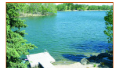
$1,695,000 Lake Bonavista Estates 3581 sq.ft. 2 storey, backing onto the lake SOLD

Over $100 million sold in real estate for 2004 and 2005.