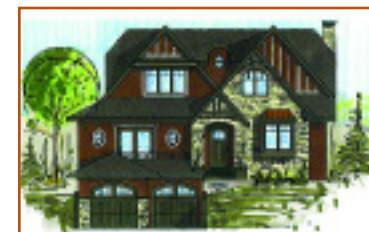
$1,600,000 Hounsfeld Heights 3500 sq.ft., new home, sold to my own buyer SOLD