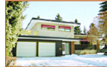
$650,000 Wildwood 1674 sq. ft. split level on beautiful 70-ft lot, on Wildwood Dr. steps to Edworthy Pk