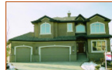
$1,095,000 Spring Valley Estates 3400 sq.ft. two storey with pie lot, mountain views & walkout basement SOLD