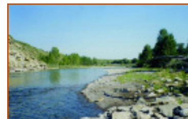
$1,370,000 Acres south of Calgary 1/2 mile on the Highwood River Rocky Mountain Views