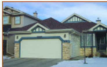
$450,000 Springbank Hill Gorgeous, open plan hillside bungalow + developed walkout & superb views!