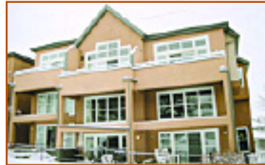
$259,000 South Calgary Upscale, contemporary 1022 sq. ft. loft SOLD @ $274,000