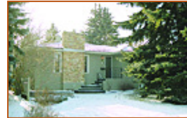
$625,000 Altadore Renovated 1622 sq. ft. bungalow SOLD @ FULL PRICE