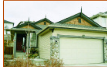
$399,000 Springbank Hill 1270 sq.ft. detached bungalow, professional landscaping SOLD @ $420,000