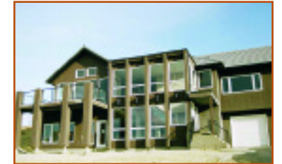
$995,000 The Slopes 2585 sq.ft. new home, spectacular mountain and valley views SOLD