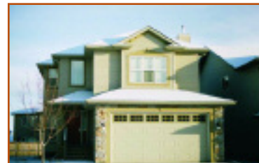
$495,000 Cougar Ridge 2240 sq.ft. upgraded Cidex-built home, walking distance to French school