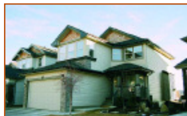
$495,000 Springbank Hill As new condition, professionally landscaped yard with trees and view