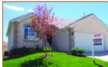
$439,000 Signature Parke Bungalow villa with developed walkout basement, great location siding the park.