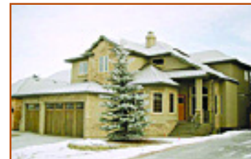
$995,000 Aspen Estates 2790 sq. ft. + developed basement SOLD @ FULL PRICE