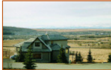
$299,000 The Slopes 1/3 acre vacant lot on cul-de-sac, mountain views