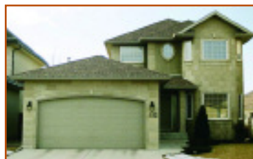
$525,000 Strathcona 3 bedroom, 2 storey with fully finished basement and south backyard SOLD @ $528,000