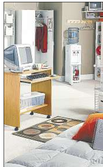
Roommates need to have a common decorating vision.