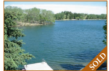
$1,695,000 Lake Bonavista Estates 3581 sq.ft. 2 storey, backing onto the lake