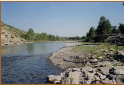
$1,370,000 65 Acres south of Calgary 1/2 mile on the Highwood River Rocky Mountain Views