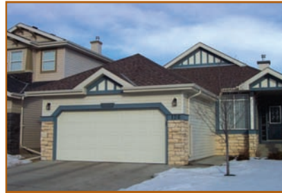
$450,000 Springbank Hill 1300 sq. ft. bungalow & dev'd walkout basement & prof. landscaped view lot