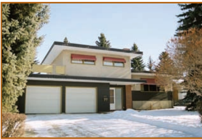
$649,000 Wildwood Wildwood Drive, beautiful 70 x 110-ft Lot, 4 level split, original owners!