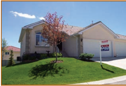
$439,000 Signature Parke 1280 sq. ft. bungalow villa with developed walkout basement, siding onto a park