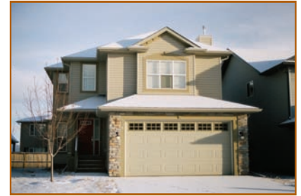
$495,000 Cougar Ridge 2240 sq. ft. Cidex-built 2-storey with contemporary flair, 3 Bedrms & Bonus Rm