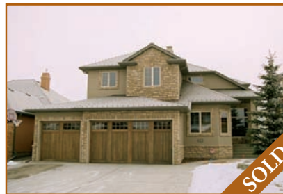
$995,000 Aspen Estates 2790 sq. ft. with developed basement SOLD at full price