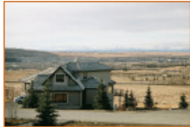
$299,000 The Slopes 1/3 acre vacant lot on cul-de-sac, mountain views