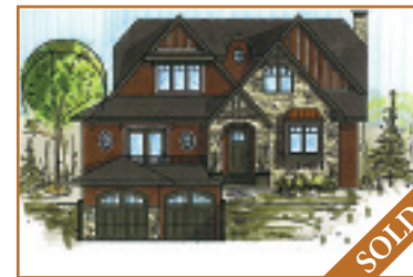
$1,600,000 Hounsfeld Heights 3500 sq.ft. new home, sold to my own buyer