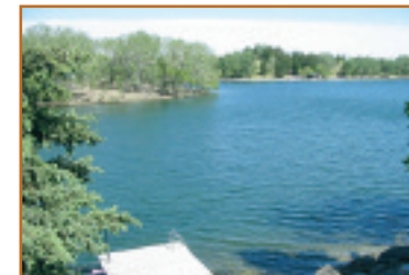
$1,695,000 Lake Bonavista Estates 3581 sq.ft. 2 storey, backing onto the lake