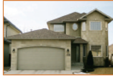
$525,000 Strathcona 3 bedroom 2-storey with fully finished basement and south backyard