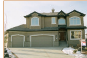
$1,095,000 Spring Valley Estates 3400 sq.ft. two storey with pie lot, mountain views & walkout basement