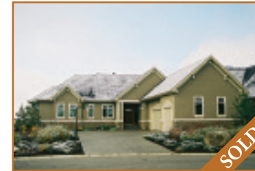
$1,100,000 Elbow Valley 2453 sq.ft. walkout bungalow, backing ravine