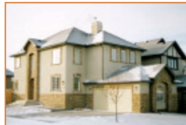
$585,000 Springborough 4 bedrooms & den, developed basement, Granite, cherry, slate, stone wine cellar