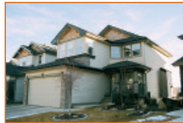
$495,000 Springbank Hill As new condition, professionally landscaped yard with trees and view