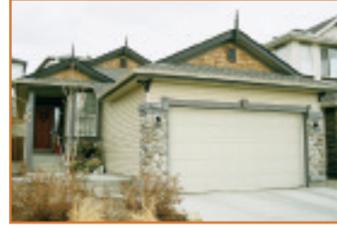
$399,000 Springbank Hill 1270 sq.ft. detached bungalow, professional landscaping