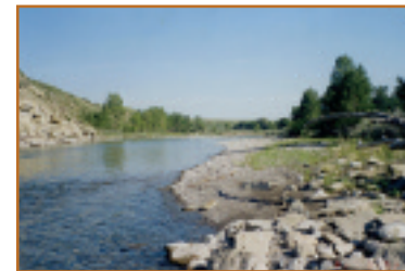
$1,370,000 65 Acres south of Calgary 1/2 mile on the Highwood River Rocky Mountain Views