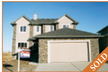
$595,000 Cougar Ridge 2614 sq.ft. new home, walkout basement, backing onto pond