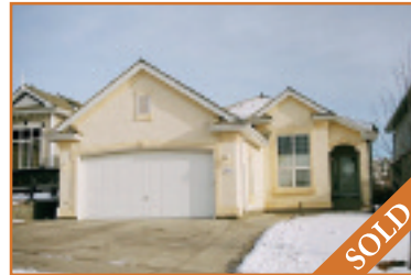
$450,000 Springbank Hill 1645 sq.ft. bungalow backing onto park