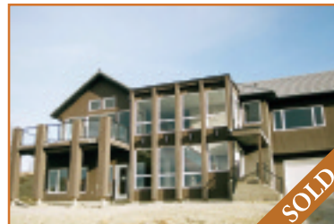
$995,000 The Slopes 2585 sq.ft. new home, spectacular mountain and valley views