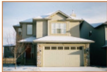
$495,000 Cougar Ridge 2240 sq.ft. upgraded Cidex-built home, walking distance to French school