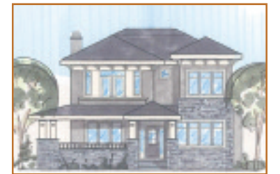
$1,400,000 Hounsfeld Heights NW 2780 sq.ft. new home