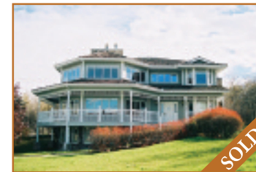
$1,390,000 Anatapi 4694 sq.ft. 2 storey, on 1 acre with views